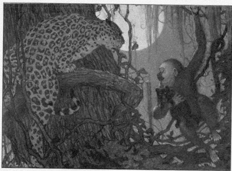
Suma waited with bated breath and blazing eyes

The Jaguar quickly slid to the ground and raced along underneath the fleeing monkey. As the latter neared the windfall Suma suddenly seemed to divine her intentions and sped on ahead, crossed the creeper-covered barrier and started up the tree the branches of which formed the far side of the aerial bridge. She had just time enough to crouch on the thick butt of a limb that overhung the passageway when the rustling of the leaves announced the arrival of Myla. A dark form emerged from the wall of trees opposite her and ran nimbly onto the swaying bridge. Suma waited with bated breath and blazing eyes as her claws crept out of their sheathes. Onward came the shadow-like figure, all unsuspecting of the vengeful fury that lay in wait; and when the monkey reached the border of her own country and, as she thought, safety, a lightning blow from a monstrous, claw-armed paw smote her from above and sent her hurtling to the cushion of creepers below.