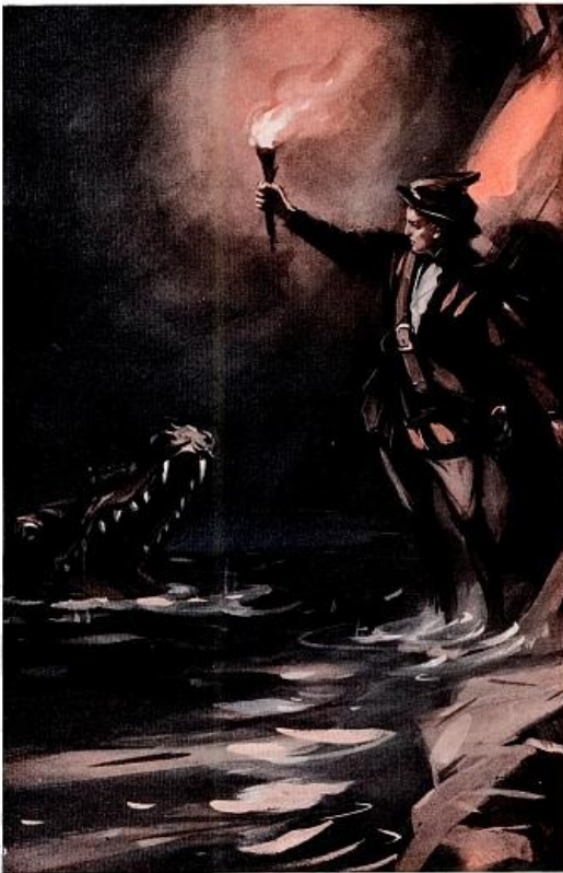
“AN ENORMOUS HEAD EMERGED”