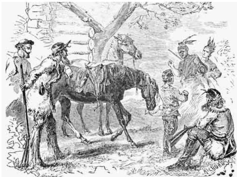
THE INDIANS' HORSES RETURNED TO THEIR OWNERS.

The speaker stooped down, drew aside his tattered leggin, and pointed to a huge blister on his leg, made by the fire into which he had rolled in his drunken frenzy. Then he pointed to me, and as he did so, his bloodshot eyes lighted up with rage and malice. I understood him to charge me with the infliction of the injury upon his leg. Since both of the thieves were so very drunk when we were at their camp, I did not at first see how they had been made aware of my presence. They did not seem to see me, and I concluded that they had identified me in the morning by the smallness of my track in the soft soil. They could not have known what transpired in their fury, but probably reasoned that, as I had been there, and taken the horses, I had burned their legs also.