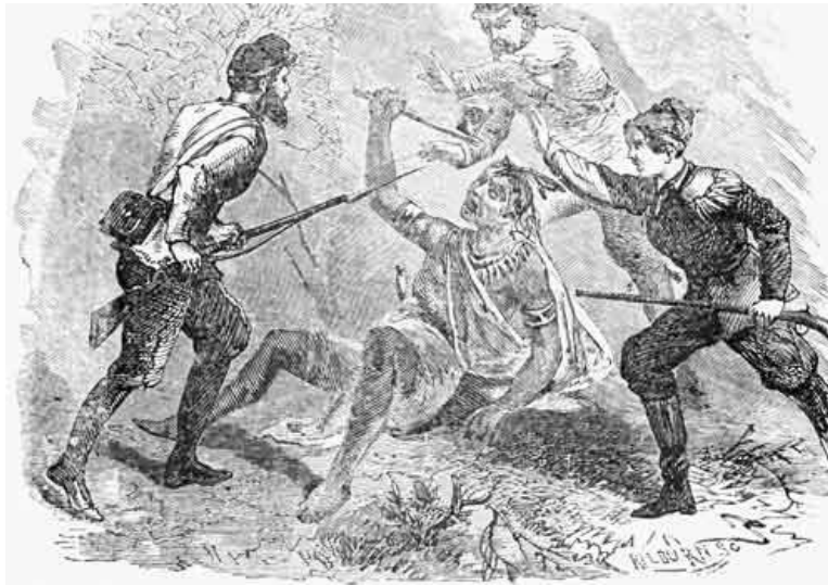
THE WOUNDED INDIAN. PAGE 203.

Morgan and Plunkett had come out of their hiding-places, and were already in hot pursuit. I followed their example, and being nearer the enemy than they, I fired. This time an Indian dropped: but his fall did not delay the flight of the others. I paused to load, and presently heard the shots of both the soldiers. They also halted to load again, and I ran ahead of them; but the savages were more fleet of foot than we, and gaining rapidly upon us, reached their boat without further loss or damage.