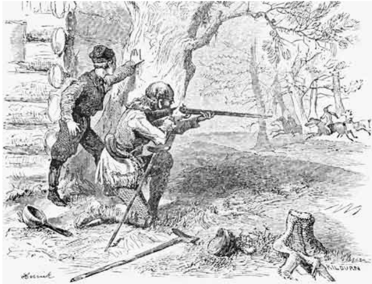
OLD MATT AND THE HORSE-THIEVES.

*** START OF THE PROJECT GUTENBERG EBOOK FIELD AND FOREST; OR, THE FORTUNES OF A FARMER ***