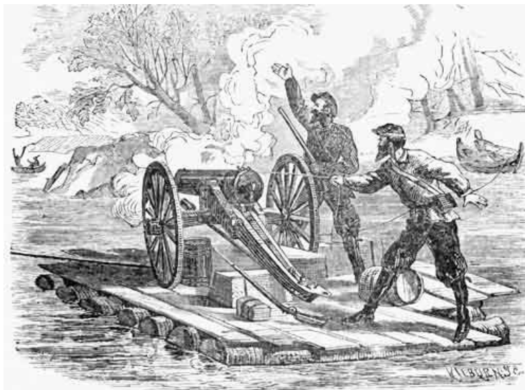
THE TWELVE-POUNDER ON THE RAFT. PAGE 212.

"I will return as soon as I can, sir," I replied, pleased that Ella should think of me at all, though I felt that I had earned a claim upon her regard.