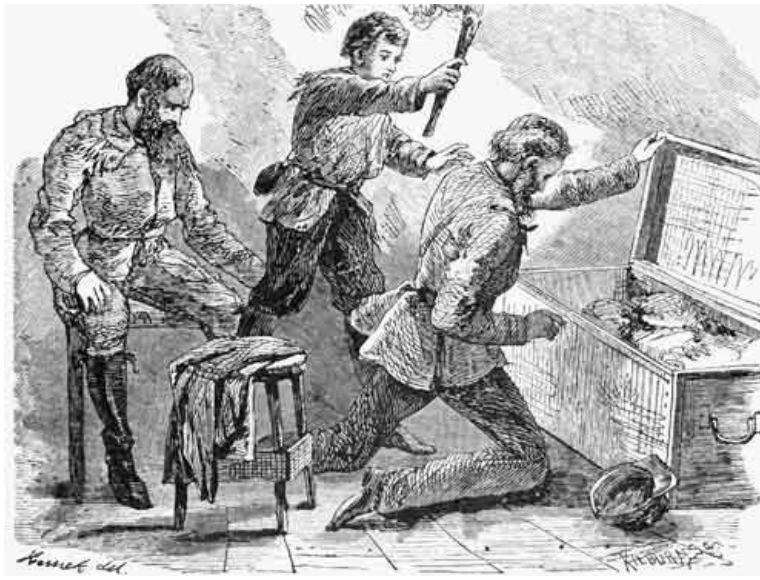
UNLOCKING THE CHEST. PAGE 263.

"Let us see what else there is in the chest," said the lieutenant. "We may find something that will give us further light on the subject."