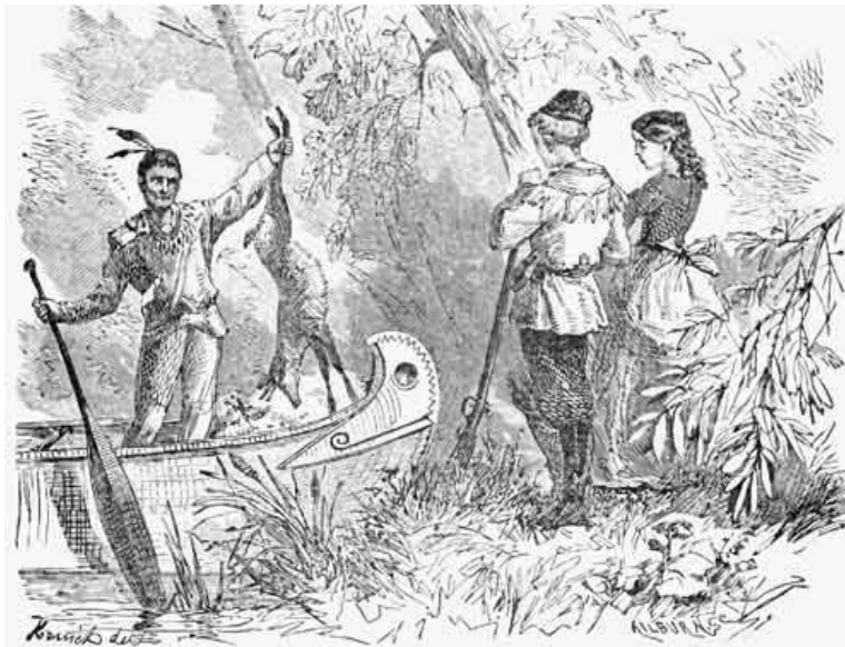
THE GRATEFUL INDIAN.