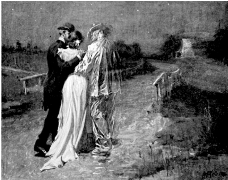
ONE OF HIS WET, SHINY ARMS WAS ROUND MAMIE'S WAIST.

I moved slowly, and I remembered afterwards that I walked on the grass, coming. I suppose it all happened in less than five minutes after that, but it seemed as if it must have taken an hour. Neither Jack nor Mamie seemed to notice the sailor. She didn't seem to know that his wet arm was round her, and little by little they got near the cottage, and I wasn't a hundred yards from them when they reached the door. Something made me stand still then. Perhaps it was fright, for I saw everything that happened just as I see you now.