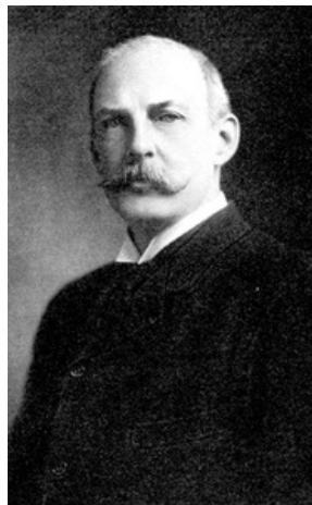
F. MARION CRAWFORD