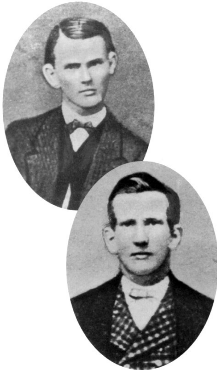
Jesse James (top) and Frank James (bottom)