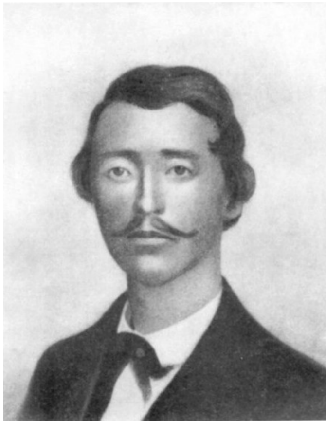
William Clarke Quantrell