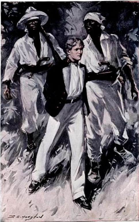
IN THE HANDS OF THE OUTLAWS

"Oh, Señor," he gasped, "for the love of God help me to get into the shadow of yonder bush. I am perishing of thirst, and this scorching sun is adding to my torments. If you will raise me to my knees perhaps I can manage to crawl to— Ah, good! I have him! Quick, José, help me! He is strong as a horse, and— So, that is right; now kneel upon him while I lash his wrists together. And Miguel,"—as the man I had left in the road a minute before came running up—"take the gun and those pistols, they will be safer in your hands than in his."