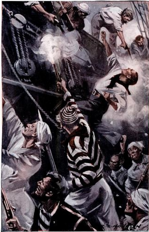
A TERRIFIC STRUGGLE

The three boat-guns spoke at almost the same instant, and so close were we now to our quarry that our grape-shot literally tore her starboard bulwarks to pieces, and a terrific outburst of shrieks and yells that instantly followed upon the discharge bore eloquent evidence to the terrible havoc that it had wrought among her crew. The moment that we had fired the boats separated, the first cutter making a wide sweep to port in order to pass under the brigantine’s