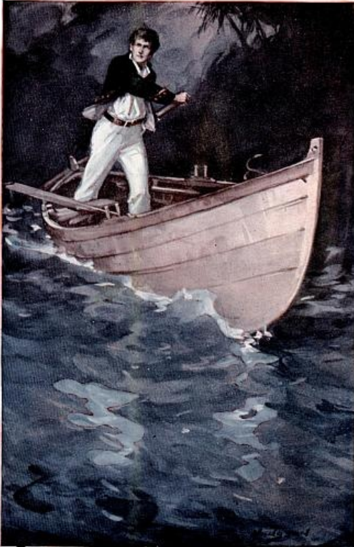
"I HEADED THE BOAT IN THE DIRECTION OF THE FELUCCA"

But it was still much too early for me to think of making a move, for sounds reached me from the outside which told me that quite a number of people were still up and about; I therefore waited, with such