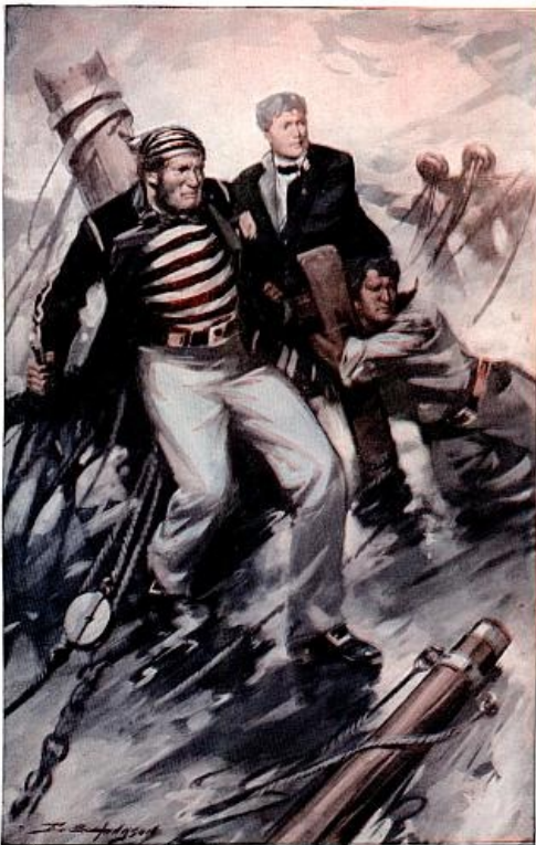
AT THE MERCY OF THE SEA

Now that the wind had moderated from hurricane force to that of a heavy gale, the sea rose with really startling rapidity, and was already running so high that when we came to set about the task of cutting