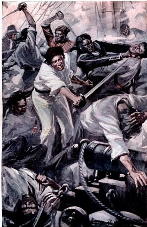
THE FIGHT FOR THE INDIAMAN

discovery that there was no netting triced up on the port or shoreward side of the vessel, the Frenchmen apparently taking it for granted that we should dash alongside on the side nearest to us. I immediately reported this discovery to the first lieutenant, at the same time mentioning my idea as to the explanation of the omission, whereupon, having