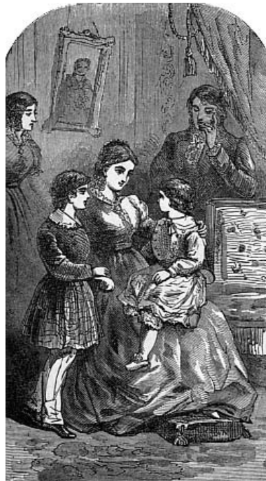
HORTENSE AND HER CHILDREN.