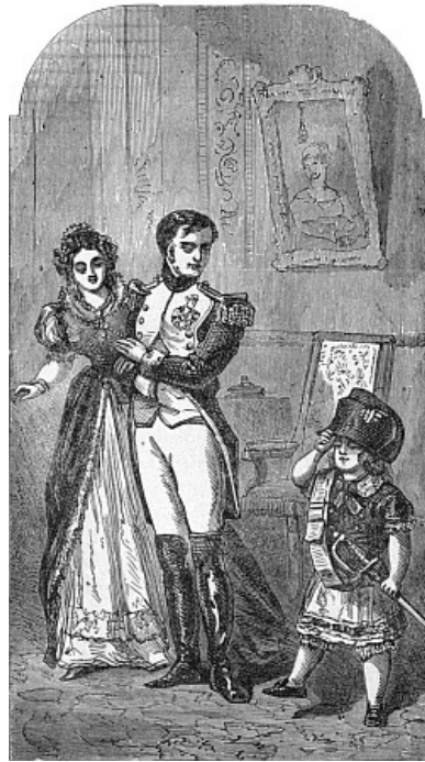
THE LITTLE PRINCE CHARLES NAPOLEON.

At midnight, on the 24th of September, 1806, Napoleon left Paris to repel a new coalition of his foes in the campaigns of Jena, Auerstadt, Eylau, and Friedland. Josephine accompanied her husband as far as Mayence, where she remained, that she might more easily receive tidings from him. Just before leaving Paris, Napoleon reviewed the Imperial Guard in the court-yard of the Tuileries. After the review he entered the saloon of Josephine. Throwing down his hat and sword upon the sofa, he took the arm of the Empress, and they together walked up and down the room, earnestly engaged in conversation. Little Napoleon Charles, who was on a visit to his grandmother, picked up the Emperor's cocked hat, placed it upon his head, and putting the sword-belt over his neck, with the dangling sword, began strutting behind the Emperor with a very military tread, attempting to whistle a martial air. Napoleon, turning around, saw the child, and catching him up in his arms, hugged and kissed him, saying to Josephine, "What a charming picture!" Josephine immediately ordered a portrait to be taken by the celebrated painter Gerard of the young prince in that costume. She intended to send it a present to the Emperor as a surprise.