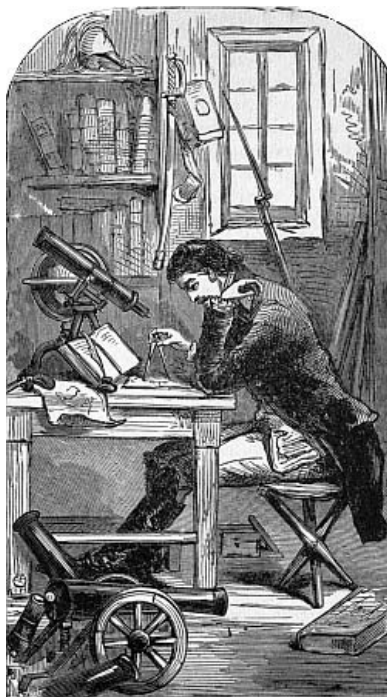
THE STUDY OF LOUIS NAPOLEON.

His personal appearance at that time is thus graphically sketched. "He is middle-sized, of an agreeable countenance, and has a military air. To personal advantages he joins the more seductive distinction of manners simple, natural, and full of good taste and ease. At first sight I was struck with his resemblance to Prince Eugene, and to the Empress Josephine, his grandmother. But I did not remark a like resemblance to the Emperor. But by attentively observing the essential features, that is those not depending on more or less fullness or on more or less beard, we soon discover that the Napoleonic type is reproduced with astonishing fidelity. It is, in fact, the same lofty forehead, broad and straight, the same nose, of fine proportions, the same gray eyes, though, the expression is milder. It is particularly the same contour and inclination of the head. The latter especially, when the prince turns, is so full of the Napoleon air, as to make a soldier of the Old Guard thrill at the sight. And if the eye rests on the outline of these forms, it is impossible not to be struck, as if before the head of the Emperor, with the imposing grandeur of the Roman profile, of which the lines, so defined, so grave, I will even add and so solemn, are, as it were, the soul of great destinies.