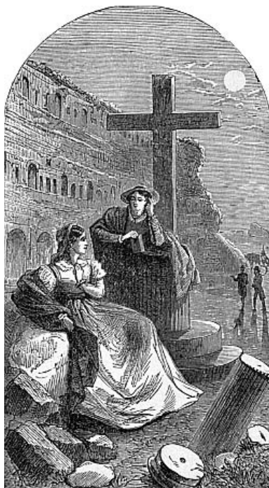
INTERVIEW IN THE COLISEUM.

"How many events have contributed to bring us together,' she said finally, turning towards me, 'events of which I often have been the puppet or the victim, without having foreseen or provoked them.'