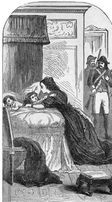
JOSEPHINE TAKING LEAVE OF HER CHILDREN.

It seems that the conversation which we have reported as having taken place in the cell of Beauharnais had been overheard by listening ears, and reported to the committee as a conspiracy for the overthrow of the Republic. The arrest of Josephine was ordered. A warning letter from some friend reached her a few moments before the officers arrived, urging her to fly. It was an early hour in the morning. There was little sleep for Josephine amidst those scenes of terror, and she was watching by the side of her slumbering children. What could she do? Should she abandon her children, and seek to save her own life by flight? A mother's love rendered that impossible. Should she take them with her in her flight? That would render her arrest certain; and the fact of her attempting to escape would be urged as evidence of her guilt.