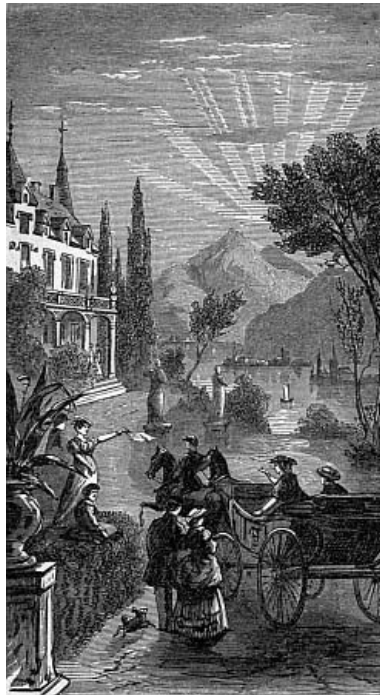
HORTENSE AT ARENENBERG.

The residence of Hortense in Augsburg was in a mansion, since called Pappenheim Palace, in Holy Cross Street. After the graduation of her children, Hortense, with Louis Napoleon, spent most of their time at Arenenberg, interspersed with visits to Rome and Florence. The beautiful chateau was situated upon a swell of land, with green lawns and a thick growth of forest trees, through which there were enchanting views of the mountain and of the lake. The spacious grounds were embellished with the highest artistic skill, with terraces, trellis-work woodbines, and rare exotics.