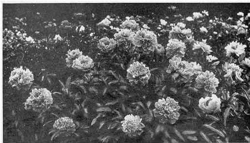
Peonies have the advantages of few enemies, long and vigorous life, beauty and, in most varieties, delightful fragrance

If you want a delightful recreation and lots of fun, and would like to possess some plant producing a flower entirely new in color or form, and, certainly in your estimation finer than any your rival neighbors have ever seen, make a reserve bed in some sunny spot and raise hybrid delphiniums. In fact any one possessing a good collection of perennials should have a reserve plantation to draw from in order to fill up gaps that will be found in the main bed after any hard winter. It is especially useful for keeping up a stock of that charming but short-lived perennial, the columbine ( Aquilegia ), which seldom can be depended upon after the second year. I am speaking of the finer forms.