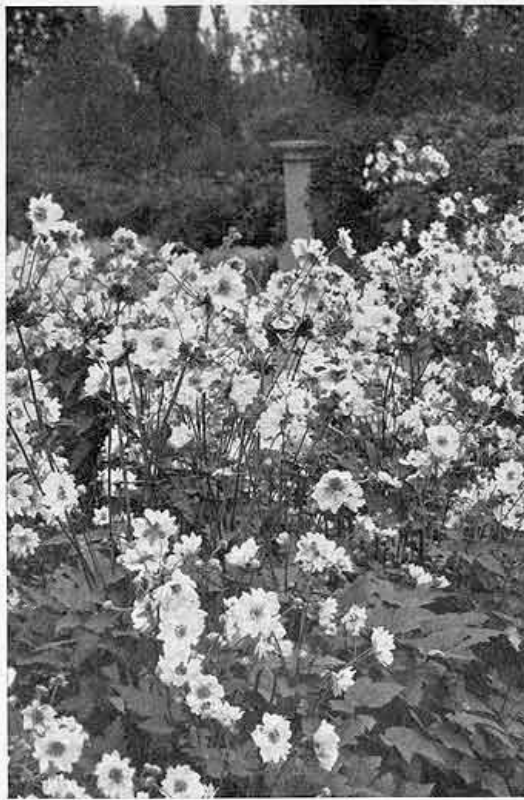
One of the brightest stars of the garden in late fall is the Japanese anemone