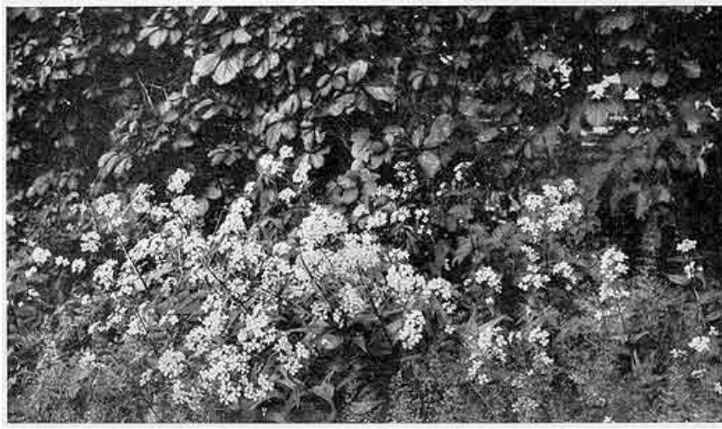
A background of vines or flowering shrubs is worth striving for, especially to set off white flowers like sweet rocket

Some perennials require to be planted two feet apart, and in some, like peonies, three feet is close enough, for in time their tops will meet. Eighteen inches apart is enough to allow for the majority and some slender ones require but one foot. All this should be taken into consideration when determining the width of the bed.