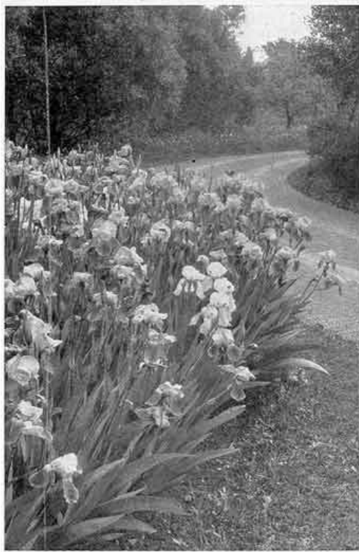
The German iris is one of the most beautiful forms in the flower world and it will flourish in practically any moderately good soil

We must remember that nine-tenths of the plants we grow are exotic—natives of distant parts and climes—coming from various atmospheric conditions, and from all kinds of soil. We bring them into our garden and grow them all under one climatic influence and in the one kind of soil we happen to possess. Certainly we cannot expect uniform success with all of them. You might as well bring into one room unlettered natives of distant climes and expect them all to enter into a general conversation. Even in gardens quite near each other, their permanence varies. I cannot grow, successfully, any of the boltonias, while within a quarter of a mile of me, in a friend's garden, they grow like weeds. Our soil is the same, and one would suppose that the climatic conditions were, still the fact remains. I merely mention this so that any novice finding that he cannot grow some plants as well as others near him, may not feel lonesome in his grief. It is, however, a good plan, when a plant supposedly easy to grow, fails to materialize, to try it in another part of your own garden, and if it does not do well there, discard and forget it—the world is full of good things.