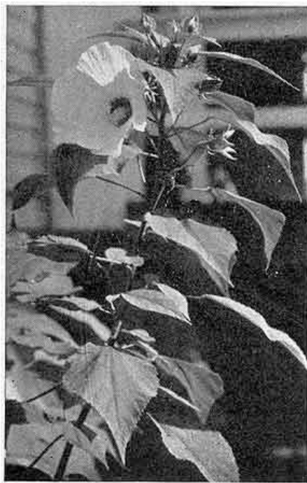
Crimson-eye hibiscus or swamp mallow, blooming in August and September