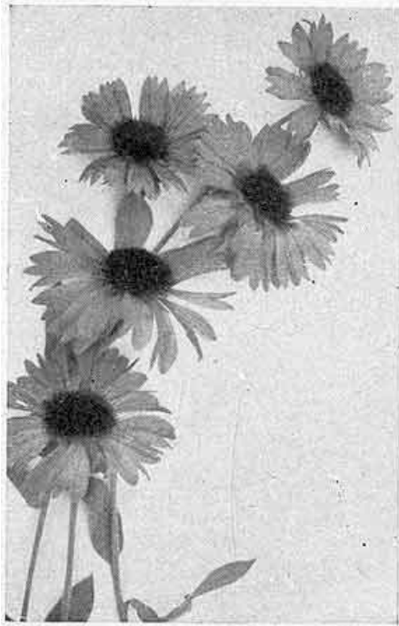
Gaillardias are at their best in the perennial form and thrive in a sandy soil