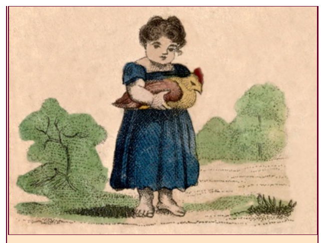
NINE TEN Who'll buy a fat Hen? Her bones are so small You may eat legs and all.