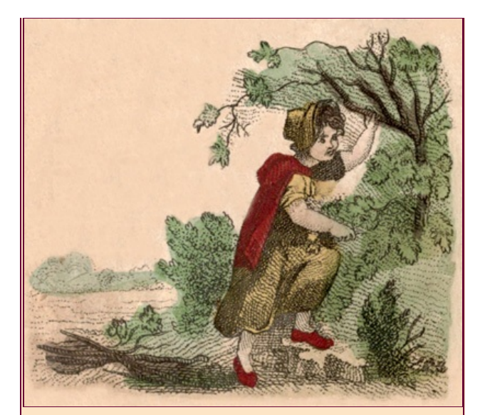
FIVE SIX I'm picking some sticks, That my mother may make