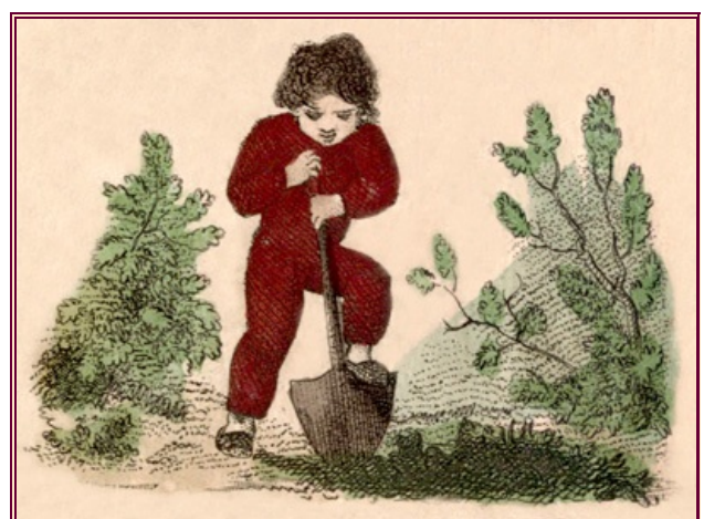
I can dig and can delve, Take care of the Sows, And bring home the cows.