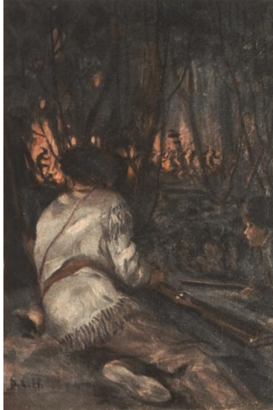
“A lot of ’em are dancin’ the scalp dance”

“But I’m afraid we ain’t goin’ to hev it, Henry. It’s comin’ straight on to the main camp, an’ it’ll be tied to the bank right in the glow o’ thar fires. Hevin’ wanted that canoe, ez we both do, we’d better quit wantin’ it an’ want suthin’ else.”