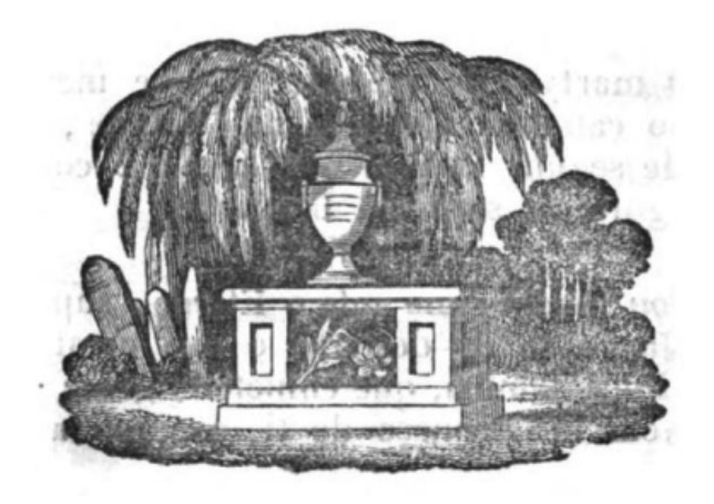
*** END OF THE PROJECT GUTENBERG EBOOK A SAUDADE: CANTO ELEGIACO ***

Canto arrebatador, delicias d'alma, Taes sons em tôrno resoar fazia: "Vive o justo no céo, do justo as preces "São ante o Eterno d'efficaz valia.