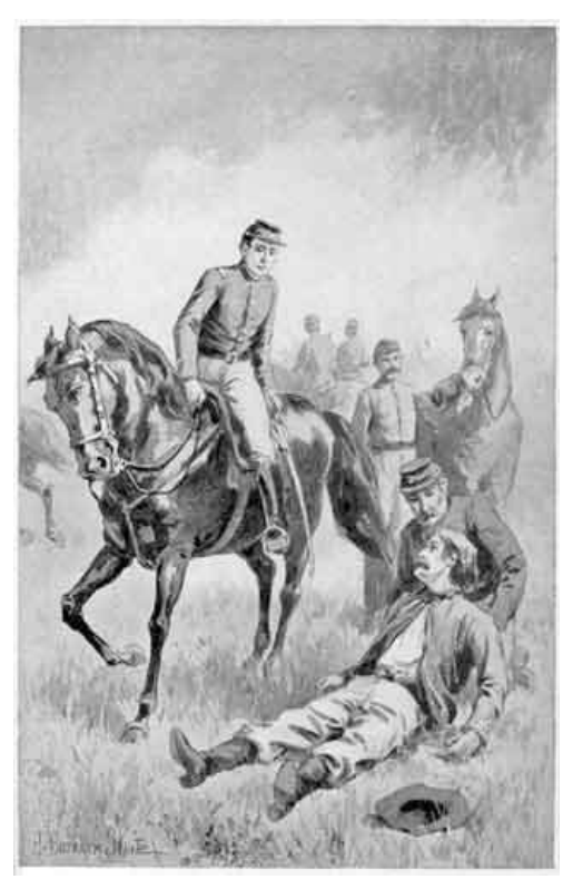
"They laid him on the grass just as the recall was sounded." PAGE\ 141.

The Union lieutenant called a man to assist him in dismounting the officer. They laid him on the grass just as the recall was sounded, and proceeded to remove his coat. The blood was flowing freely from both of his wounds, and he was quite faint. But Deck saw at once that the wound was not fatal; and he sent word to the Confederate surgeon, who was attending to the men that were brought into the field in the rear of the column, that he was needed for the officer of his command.