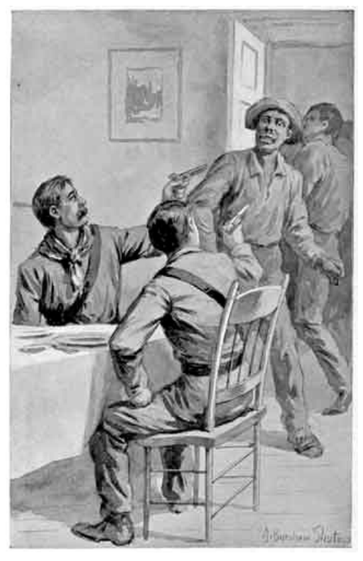
"The unwelcome visitors pointed their weapons." PAGE~461.

The lady deemed it prudent to retire; but four stout negroes appeared at the door. The unwelcome visitors pointed their weapons at them, and they fled at the sight of them. The two black women became very tractable, and the wanderers ate their fill of ham and eggs, supplemented with waffles. Deck left his thanks and two dollars for the lady of the house, and they retired. They went to the stable next, where they found four horses. They took from the harness-room a couple of plain saddles and bridles, with which they prepared the two best horses for their own use. Mounting them, they hastened up the road on the bank of the creek.