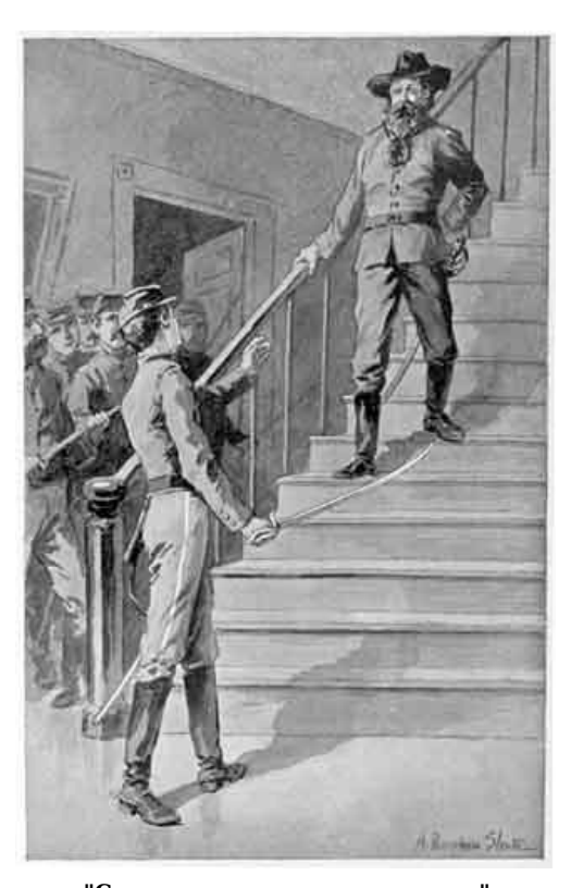
"Come down, or you are a dead man." PAGE 64.

"You are my prisoner, and I intend to secure you properly. Give me your sword and pistols."