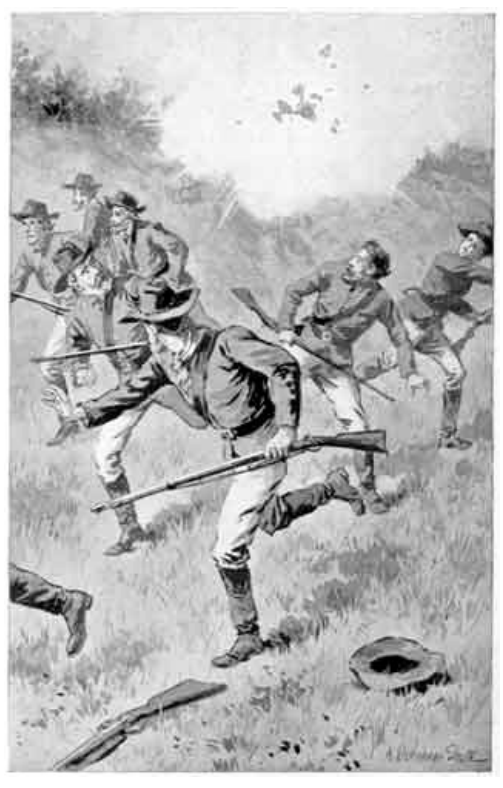
"The sharpshooters rushed down the declivity." P_{AGE}\ 262.

Doubtless the colonel of the regiment, ashamed of the conduct of the fleeing infantry, was rallying his men for the advance; for presently it resumed its march. But at that moment a new factor in the contest was presented to the aide-de-camp. The roar of a heavy gun was heard in the direction of the intrenchment, and both of the spectators on the hill looked in that direction. A cloud of smoke rose in the air, and at the same moment, almost, the explosion of a shell was seen on the riflemen's hill. The branches of the trees were cut off and twisted, and the sharpshooters rushed down the declivity as though their own weapons had been turned against them.