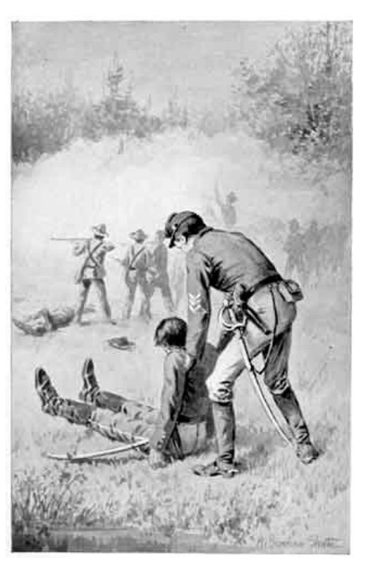
"Sergeant Fronklyn dragged the form of Lieutenant Lyon out of the mêlée." P_{AGE}\ 299.

*** START OF THE PROJECT GUTENBERG EBOOK A LIEUTENANT AT EIGHTEEN ***