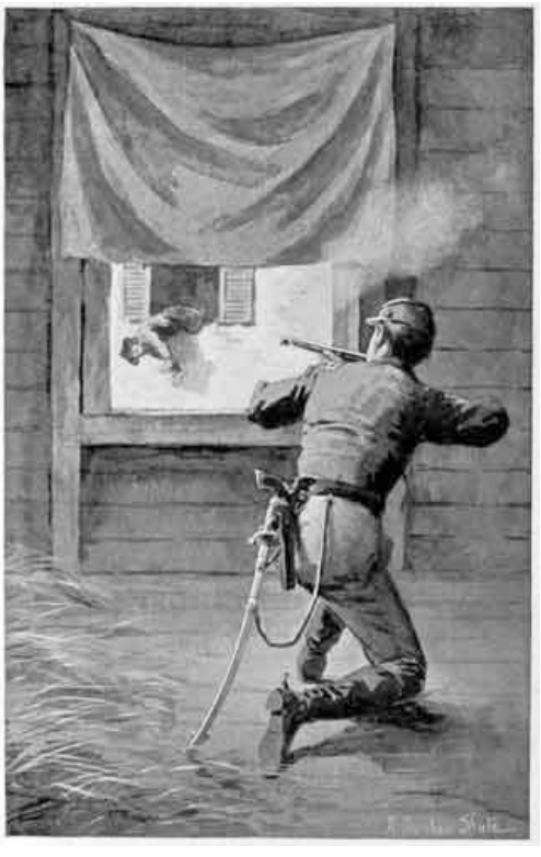
"The ball struck him in the head." PAGE 388.

The ruffian dropped from the window-sill to the ground with a heavy thud, and did not move again. The ball had penetrated his brain, and he was the victim of his unscientific observations. But the lieutenant did not remove his gaze from the open window. It seemed very like slaughter to shoot down the enemy in this manner, and a twinge of conscience disturbed him. But he reasoned that he had given the ruffians a chance to surrender, which they had refused to accept. Then they were pirates, robbers, making war for gain against friend and foe alike.