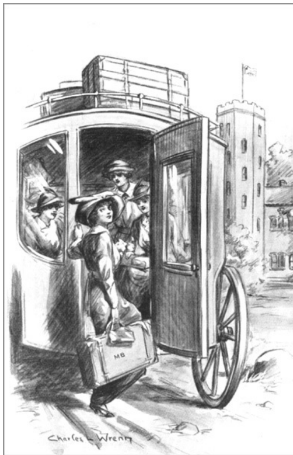
Good-bye to Wellington and the old happy days.— Page 303.

Good-bye to Wellington and the old happy days! Good-bye to the Quadrangle and the Cloisters! Good-bye to all the dear familiar haunts and faces.