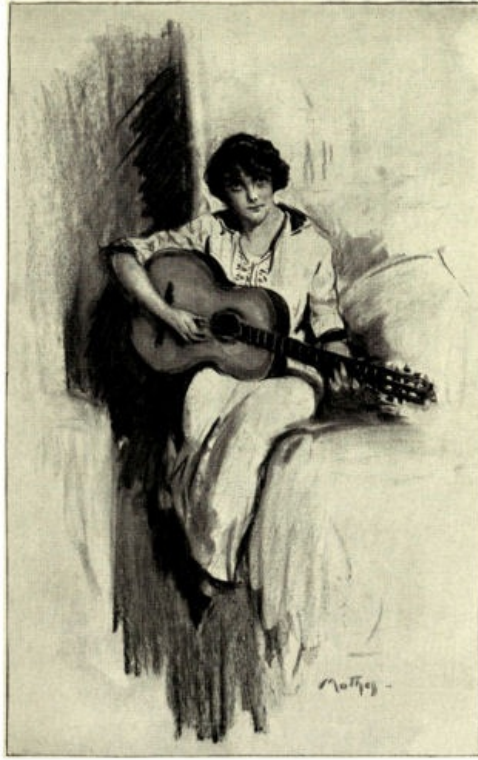
It was a love song of old Spain

... And that night, that very night, that very wondrous, silent, throbbing night of the Sabbath and the South, when all the air was as it seemed to me in saturation, in a suspense of ecstasy, to be broken, to be precipitated by a word, a motion, a caress, a note ... that night, I say, as I sat on the forward deck alone, I heard, far off and faint as though indeed it were the lute of Andalusia, the low, slow, deep throb of a guitar!... My whole heart stopped. I was no more than a focused demand of life. Reason was gone from me, not intellect but emotion—that is its basic thing after all, emotion born on earth but reaching to the stars.... I listened, not hearing.... It was the air we had heard long ago, a love song of old Spain, written, perhaps, before DeSoto and his men perished in these very bayous and forests that now shielded us against all tumult, all turmoil, all things unhappy or unpleasant. The full tide of life and love swept through my veins as I listened.