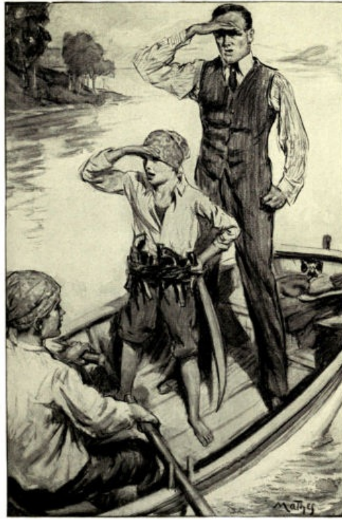
I, too, stood, shading my eyes with my hand

Ah, what a fine new world was this which lay before us! But for one thing, this had no doubt been the happiest moment in my life. For, always, the attaining of knowledge, the growth of a man's mind and soul, had to me seemed the one ambition worth a man's while; and now, as I might well be assured, I had learned more and grown more, these last twelve hours or so, than I had in any twelve years of my life before. Before me, indeed, had opened a vast and wonderful world. That morning, as we swept around curve after curve of the swift trout-stream that I loved so well, among my alders, through my bits of wood, along my hills—with Lafitte and L'Olonnois standing, each alert, silent, peering ahead under his flat hand to see what might lie ahead (I astern with Partial's head on my knee), I felt rise in my soul the same sweet grateful feeling that I had when the new world of music opened to me, what time I first caught the real meaning of the Frühlingslied . My heart leaped anew in my bosom, for the time forgetting its sadness. I saw that the world after all does hold faith and loyalty and friendship and perpetual, self-renewing Youth.... I also rose, cast my hat aside, and with one hand reaching down to touch my friend's head, I, too, stood, shading my eyes with my edged hand, peering ahead into this strange new world that lay ahead of me.