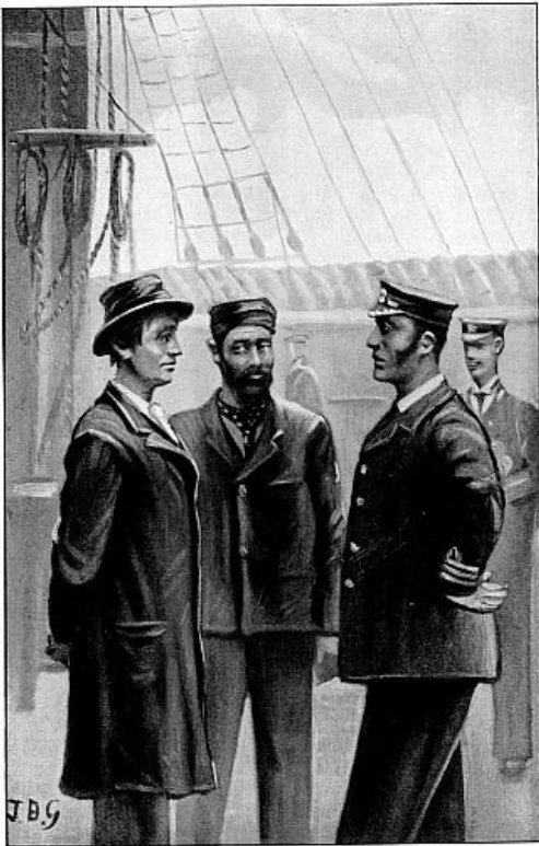
Upright and Downright.

The next chap stated he had been an able seaman in his previous ship, so he was sent on to the fore-castle to add to the long roll already there.