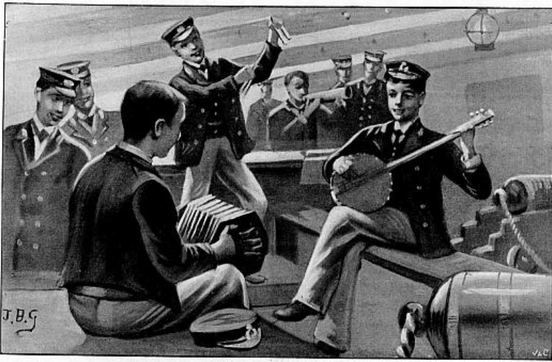
"Harmony in the Gunroom."