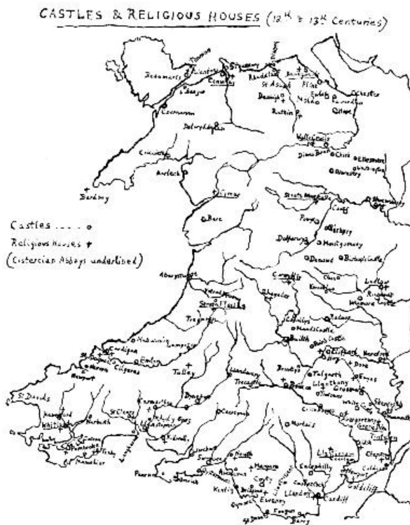
See larger image