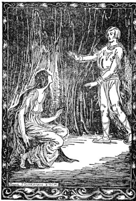
She saw before her a glorious figure, Prince Ember.

A cry of wonder broke from the lips of the Shadow Witch. With her large eyes fixed upon him, sorrow fled from her face, and in its stead came joy where joy had never dwelt before. How had he come to her? she asked herself, to her in this dark prison? How had he pierced the thickness of those cruel walls? Why should his eyes rest with love upon her, the grey Shadow Witch? And yet it was true—he was here, this glorious prince—come to save her!