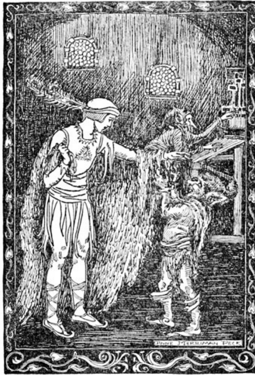
Prince Ember stretched eager hands to receive it.

"Give heed to my words," the Elf admonished him, as he delivered it to him. "In the Cave of Darkness only will you be endangered by the spells of the Wizard himself. There only he has power, and he never leaves its shelter and the weapons of enchantment which it contains. But in the lands without he has powerful and evil friends, who will not be slow to help him against his enemies if he desires it. From all but one of these the Cloak will conceal you."