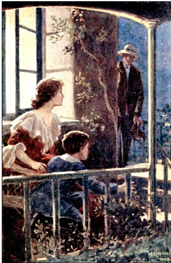
The shadow of a man fell aslant the corner of the veranda.