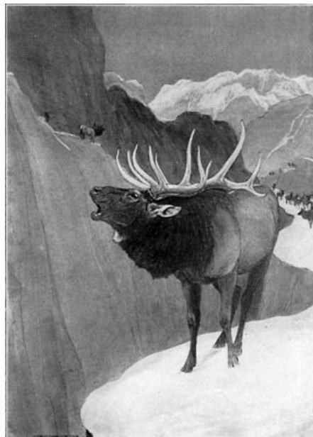
The elk migration had begun. Page 63.

Breed sensed the coming storm. The movements of the elk herds told him it would be a heavy one. It was nearing the end of the elk rutting moon but the bulls were still bugling. Breed heard the clear bugle note of an old herd bull, the piercing sound reaching him from many miles back among the snowy peaks. It was closely followed by others. The elk migration had begun; the herds were evacuating the lofty basins of their summer range and boiling out through the high passes of the peaks before the snowfall of the coming storm should block them in,—coming down to winter in the lower valleys of the hills.