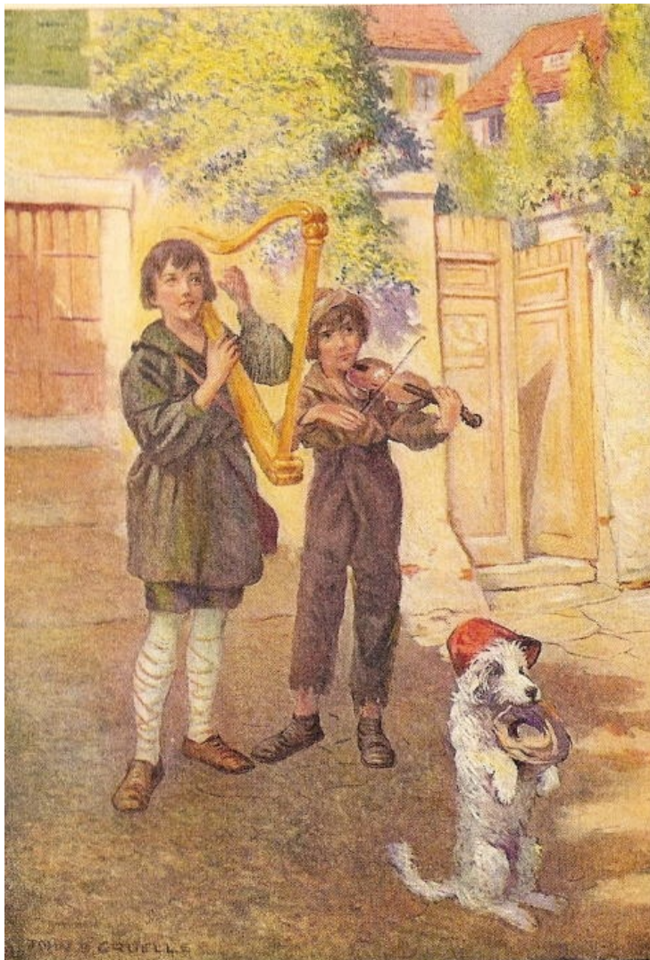
"THE FIRST APPEARANCE OF REMI'S COMPANY." (See page 230 ) Frontispiece