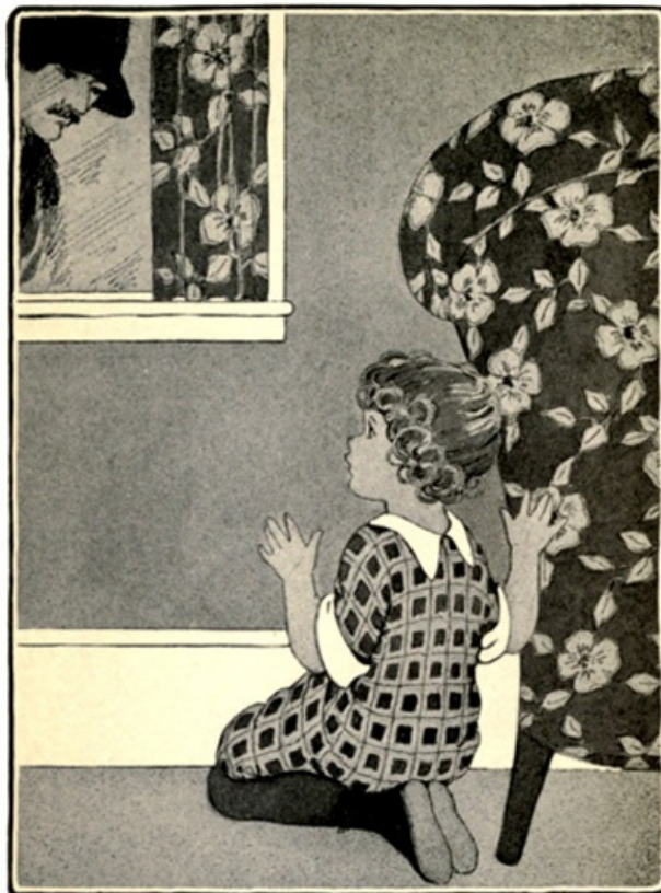
LOOKING IN THROUGH THE WINDOW SHE SAW THE FACE OF A MAN. Page 160