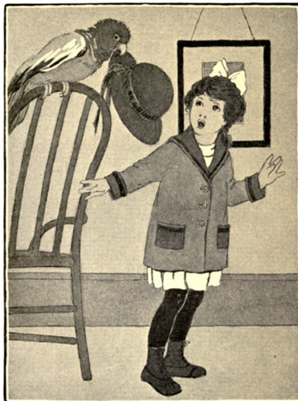
SHE TURNED AND SAW HER HAT IN THE BEAK OF A BIG RED AND GREEN BIRD. Page 115

"It wouldn't be wonderful if you forgot even your names," laughed Uncle Toby, "considering all the excitement that was going on when we got here. But we're all right now, I guess."