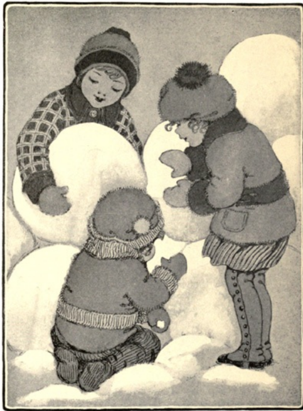
OTHER SNOWBALLS WERE LIFTED ON TOP OF THE FIRST LARGE ONES. Page 195