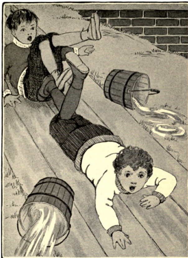
"WE BOTH WENT DOWN THE SLIDE TOGETHER WITH THE PAILS." Page 38

And as Mr. and Mrs. Martin and Janet and Nora hastened out they saw that both boys were dripping wet, and as they untangled their legs from each other and stood up, it could be seen that they were now shivering, for the night was cold. [37]