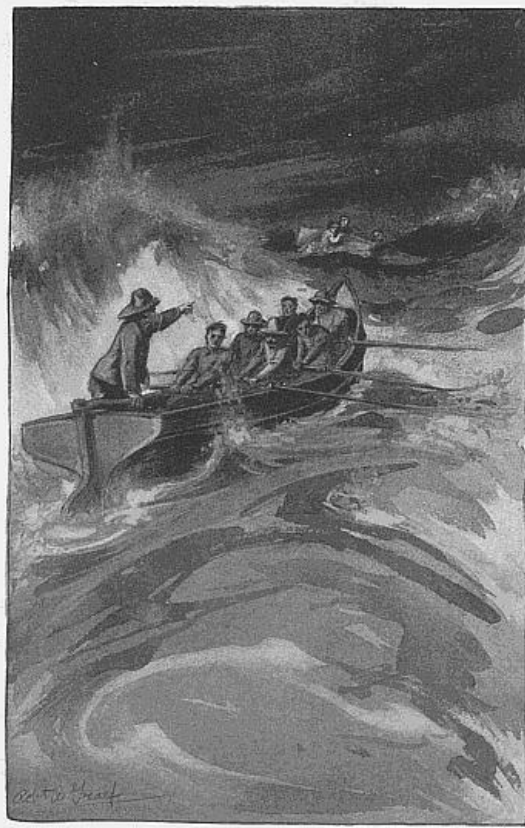
Suddenly he half rose in the tossing boat and shouted to the rowers (Page 13)