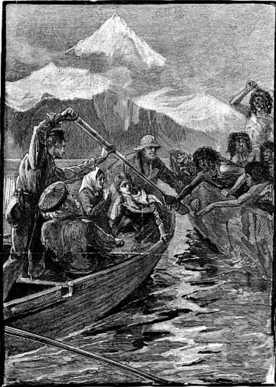
THE FUEGIAN WOMAN CLUTCHES AT LEOLINE'S SCARF. 89

The Fuegian women are no less solicitous than the men about the barter, and eagerly take a hand in it. Unlike their sisters of civilisation, they are willing to part with articles of personal adornment, even that most prized by them, the