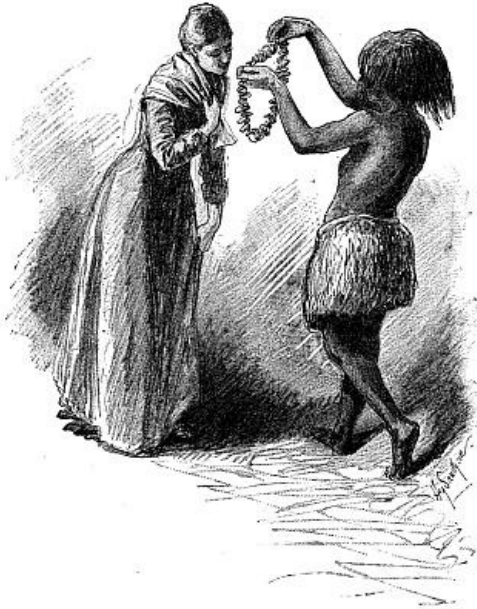
GIFT OF GRATITUDE.

Meanwhile, Ocushlu is engaged in conversation with Mrs Gancy and Leoline. She is about the same age as the latter;