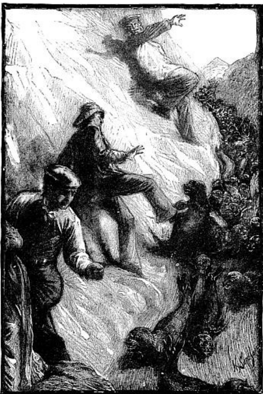
AN ARMY OF SEALS.

They do look out, or rather up, and with no little alarm. But the cause of it none can as yet tell. But they see Seagriff spring to one side of the gorge and catch hold of a rock to steady himself, while he shouts to them to do the same. Of