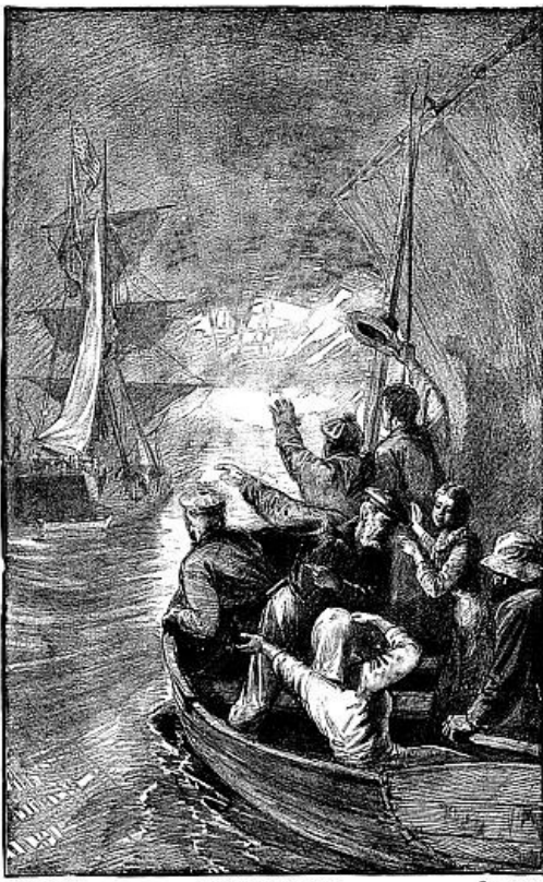
Frontispiece UNEXPECTED SUCCOUR See p. 237

This was the last peril encountered by the castaways that claims record here. What came after were but the ordinary dangers to which an open boat is exposed when skirting along a rock-bound storm-beaten coast, such as that which forms the southern and western borders of Tierra del Fuego. But still favoured by the protecting hand of Heaven, they passed unharmed through all, reaching Good Success Bay by noon of the third day after.