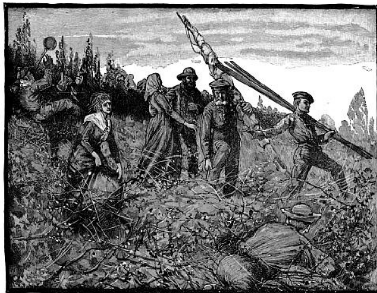
A FATIGUING WALK THROUGH THE UNDERGROWTH.

After toiling up the steep acclivity for nearly two hours, they arrive at a point where the tall timber abruptly ends. There are trees beyond—beeches, like the others, but so dwarfed and stunted as to better deserve the name of