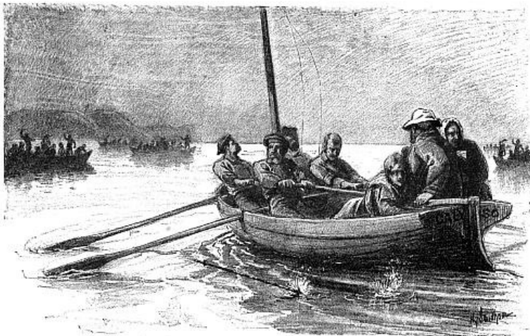
"ARE WE TO BE STONED TO DEATH?"

His words spur them to a fresh effort, and the boat bounds on, the oars almost lifting her out of the water. The canoes abeam begin to fall astern, but those on the bows are forging dangerously near, while the savages in them, now on their feet, brandish spears and wind their slings above their heads. Their