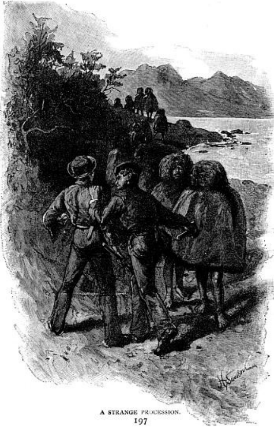
A STRANGE PROCESSION. 197

As they advance along the beach at a slow pace, in weird, ogre-like procession, the white people are for a time