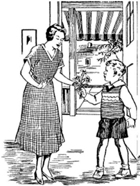
FLOWERS FOR MOTHER