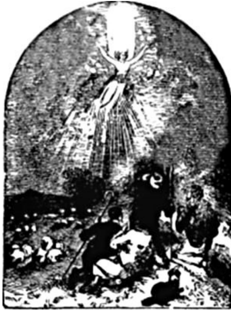
THE ANGEL'S APPEARANCE

“Fear not: for, behold, I bring you good tidings of great joy, which shall be to all people. For unto you is born this day in the city of David a Savior, which is Christ the Lord. And this shall be a sign unto you; Ye shall find the babe wrapped in swaddling-clothes, lying in a manger.”