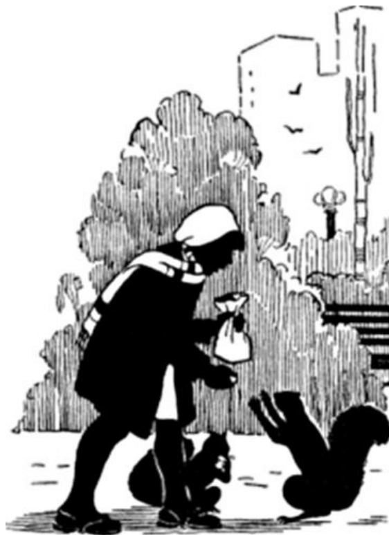
FEEDING THE SQUIRRELS