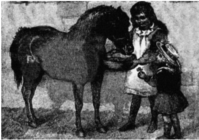
THE PET PONY