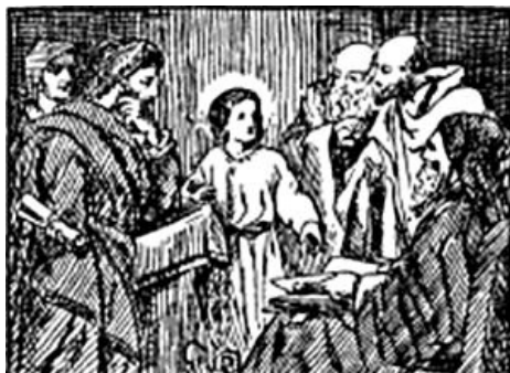
THE BOY CHRIST WITH THE WISE MEN

When God sent his Son to the earth, he gave him into the care of two good people who lived in a small town called Nazareth.