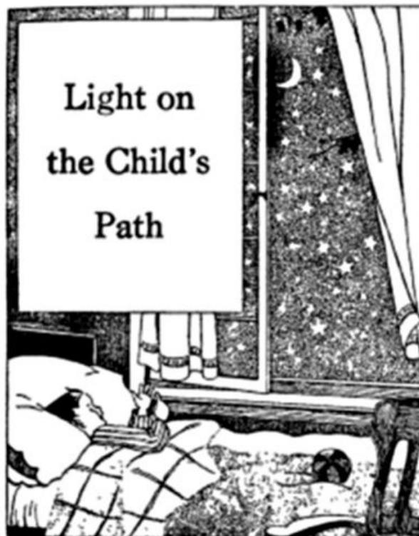
COUNTING THE STARS