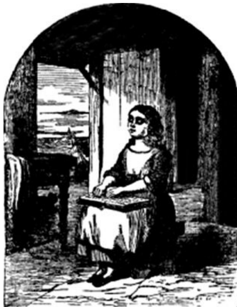
BLIND GIRL READING

See the poor blind girl reading the book. Poor girl! she can hear the birds sing, and can smell the pretty flowers, but she can not see how lovely they are. [Pg 107]