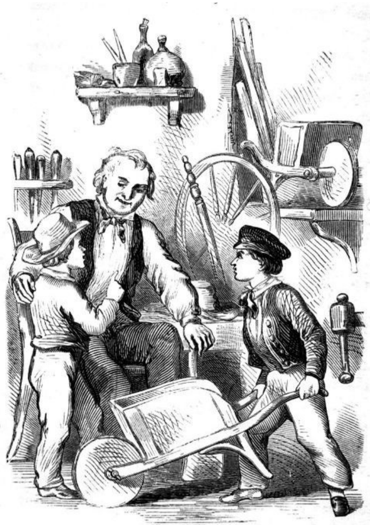
ROLLO TOOK HOLD OF HIS WHEELBARROW. Page 63.