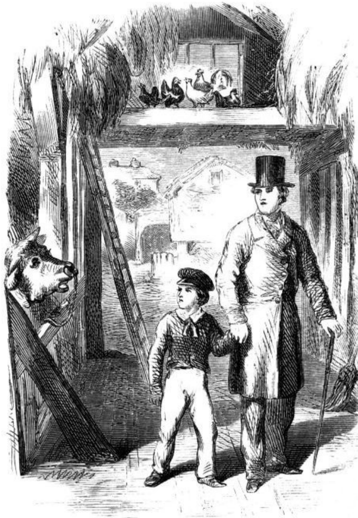
THE BULL CHAINED BY THE NOSE Page 100.