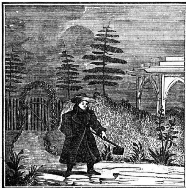
Work in the Rain.

In a few minutes, she came back, and said that his father consented, but that he must go himself, and put on the old clothes, without troubling his mother, and then, when he came back, he must rub himself dry with a towel, and put on his common dress, and put the wet ones somewhere in the shed to dry; and when they were dry, put them all back carefully in their places.