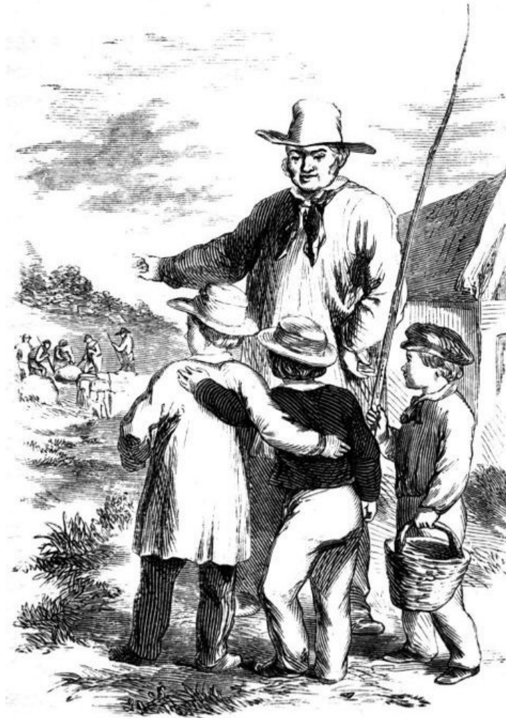
THERE SAID HE SEE HOW MEN WORK. Page 146.

[pg 147] "It is that man who is pointing now," said the farmer, "to another stone. He is telling them which to take next. Watch them now, and you will see that he directs every thing, and the rest do just as he says. But you are all directing and commanding together, and there is nobody to obey. If you were moving those stones, you would be all advising and disputing together, and pulling in every direction at once, and the stone would not move at all."