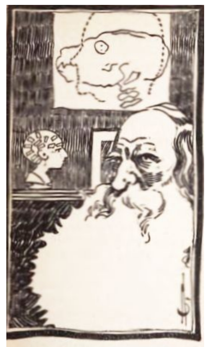
THE LEARNED PHRENOLOGIST