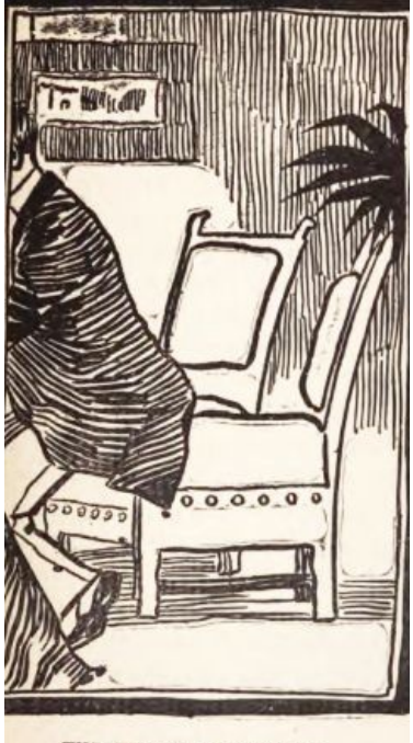
THE WILLING PERFORMER