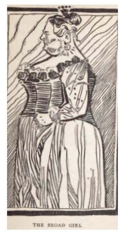
THE BROAD GIRL

As soon as she struck the Plank Walks, and began stalking her prey, the small Children would crawl under the Beds, while Mother would dry her Arms on the Apron, and murmur, "Glory be!" They knew how to stand off the Rent-Man and the Dog-Catcher; but when 235 pounds of Sunshine came wafting up the Street, they felt that they were up against a New Game.