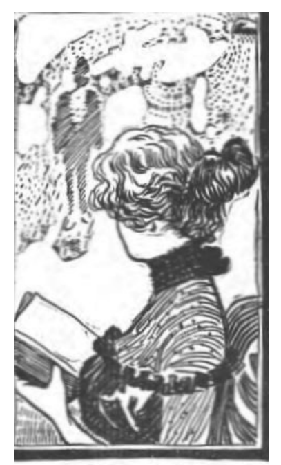
A STRANGE MAN

Now she began to see the other Kind; the Kind that Wears a Cutaway, with a White Flower, in the Morning, a Frock, with Violets, in the Afternoon, and a jimmy little Tuxedo at Night.