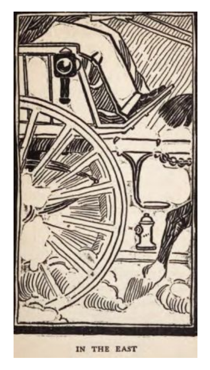
IN THE EAST

But Daughter, after much Pleading, induced Father to send her to a Finishing School in the East. (A Finishing School is a Place at which Young Ladies are taught how to give the Quick Finish to all Persons who won't do.)