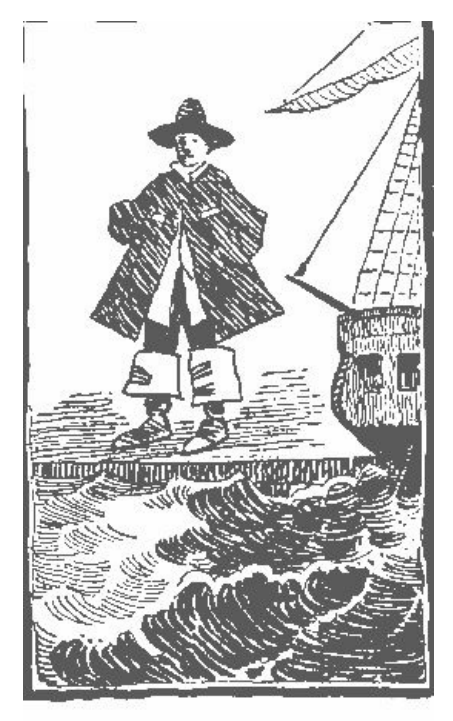
NEW YORK MAN