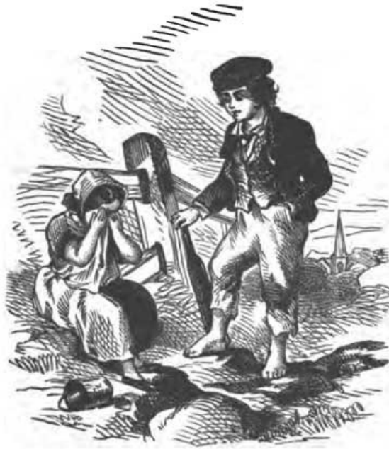
CRYING FOR SPILLED MILK.