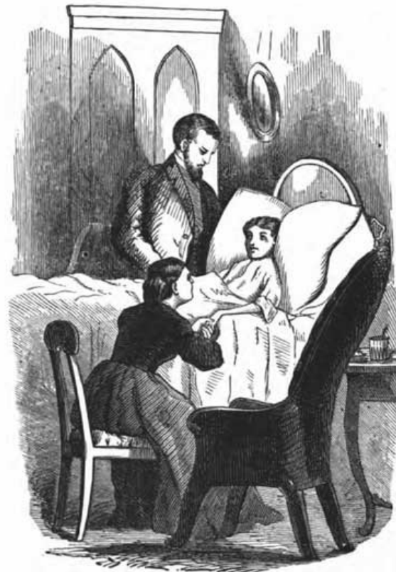
KATE TELLS THE WHOLE STORY.