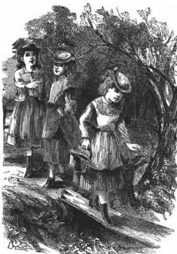
KATE A BETTER GIRL.

From that time, Kate was a better girl, and tried hard to reform her life and character. She tried so hard, and succeeded so well, that she very soon lost the name of "Careless Kate."