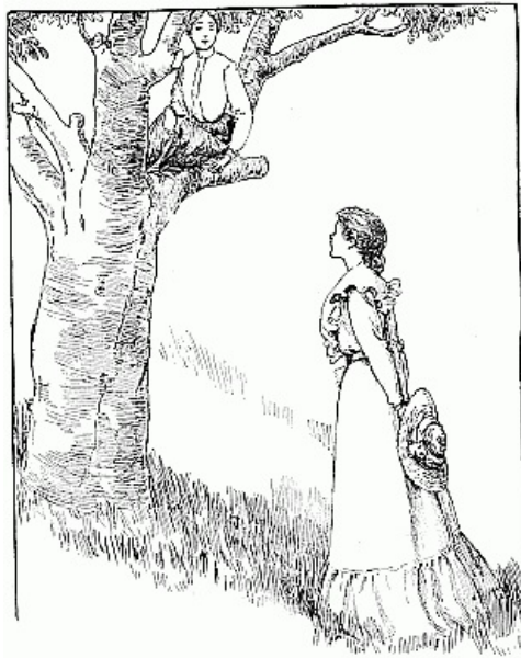
"SHE LOOKED UP, AND SAW GRACE SITTING ON A BROAD, LOW BRANCH."

rugged bark, and not daring to look below.