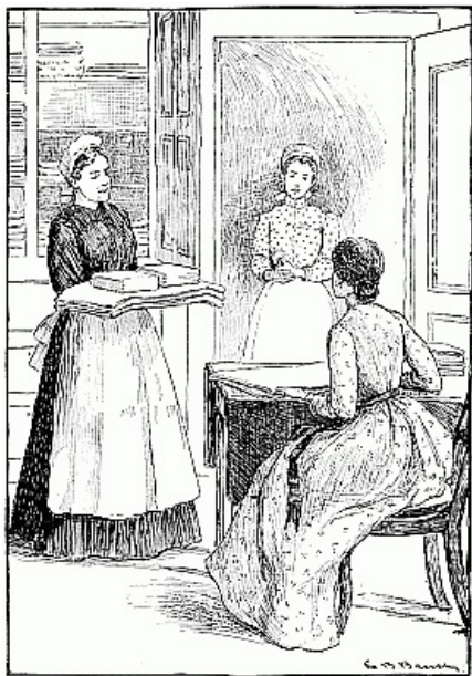
"AT THIS MOMENT POLLY APPEARED RED-CHEEKED AND BREATHLESS."

"Tell him I will be down directly, Polly," said Margaret.