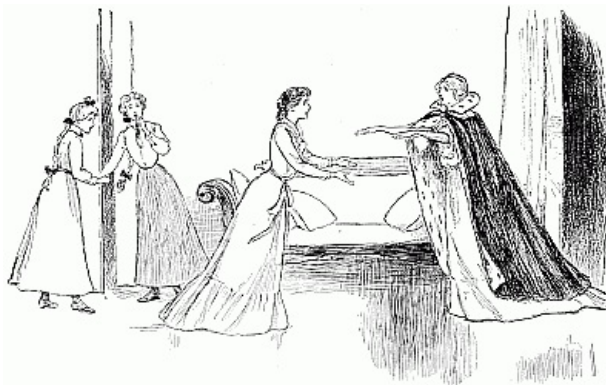
"A TALL, SLENDER FIGURE HALF RAN, HALF TOTTERED INTO THE ROOM." [182]

"Suppose there should!" said Peggy, coolly. "If Frances and I and the dogs could not arrange matters with a robber, it would be a pity. Margaret—what is this queer light? Has everything turned red, all of a sudden?" [181]