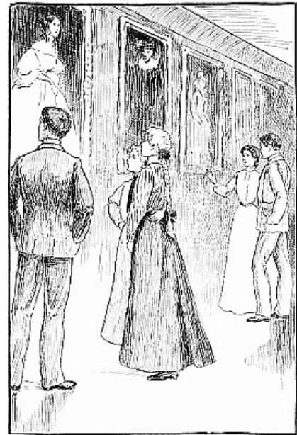
"ON THE SECOND LANDING THEY PAUSED TO SALUTE THE OLD PORTRAITS."

There on the floor of the closet lay a figure which might at the first glance have alarmed a stouter heart than fifteen-year-old Jean's,—the figure of a woman, scantily draped in white. The arms were stretched out stiffly, the face, with its staring eyeballs, over which fell some lank wisps of hair, was turned toward the door. No wonder Jean was terrified.