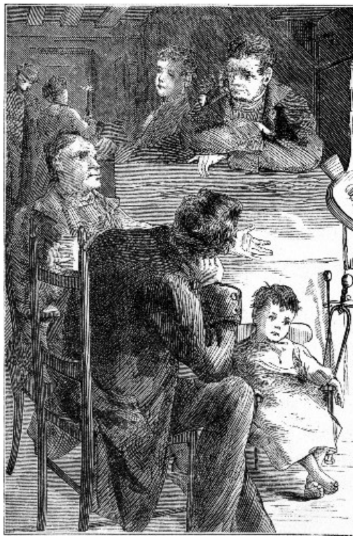
The Little Sleep-walker.—Page 31.

In fact, Willy was fast asleep and dreaming; and all the difference between him and other sleepers was, that he acted out his dreams. [Pg 31]