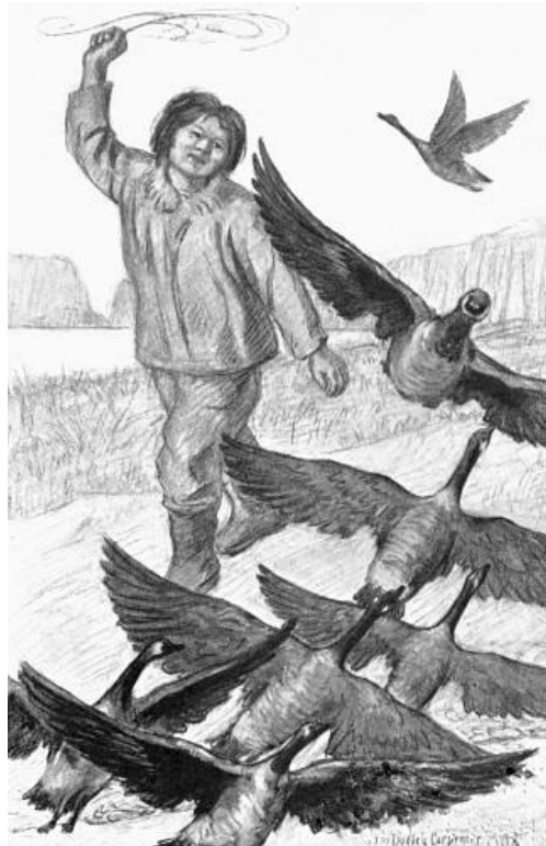
THE ALEUT BOY LAUNCHED HIS MISSILE INTO THE MASS OF FLYING FOWL

But Skookie did not undertake to throw so long as the geese were on the ground. He knew that the young geese were weak and not used to flight, and that even at its best a wild goose is slow and heavy to take wing.