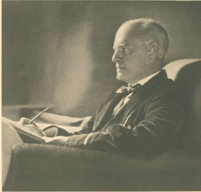
© Camera portrait by A. Whipple