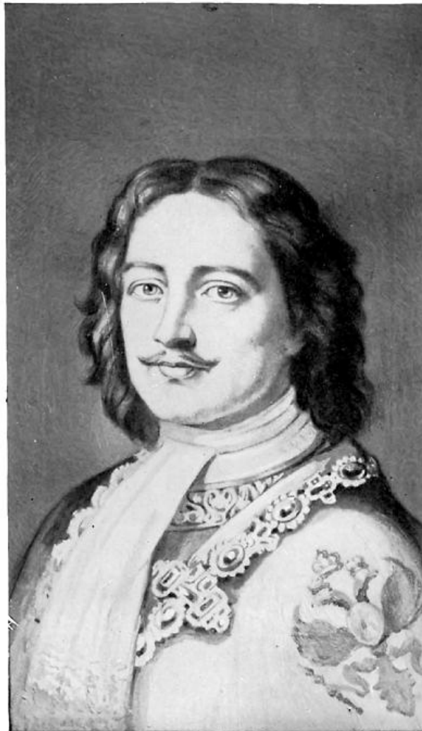
PETER THE GREAT.

THE return of Peter the Great from his European journey was marked by other events than his cruel revenge upon the rebellious Strelitz. That had affected only a few thousand people; the reforms he sought to introduce affected the nation at large. The Russians were then more Oriental than European in style, wearing the long caftan or robe of Persia and Turkey, which descended to their heels, while their beards were like those of the patriarchs, the man deeming himself most in honor who had the longest and fullest crop of hair upon his face.