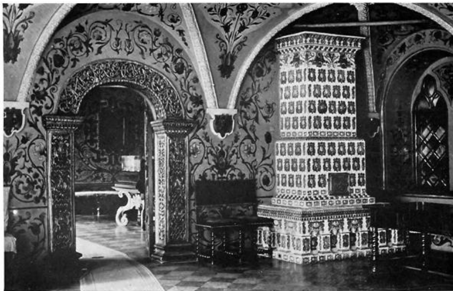
DINING-ROOM IN THE PALACE OF PETER THE GREAT. MOSCOW.

All this was too much for the leaders of the Strelitz, who represented old Russia, as Peter represented new. They resolved to sacrifice the czar to their rage. Tradition tells the following story, which, though probably not true, is at least interesting. Two leaders of the Strelitz laid a plot to start a fire at night, feeling sure that Peter, with his usual activity, would hasten to the scene. In the confusion attending the fire they meant to murder him, and then to massacre all the foreigners whom he had introduced into Moscow.