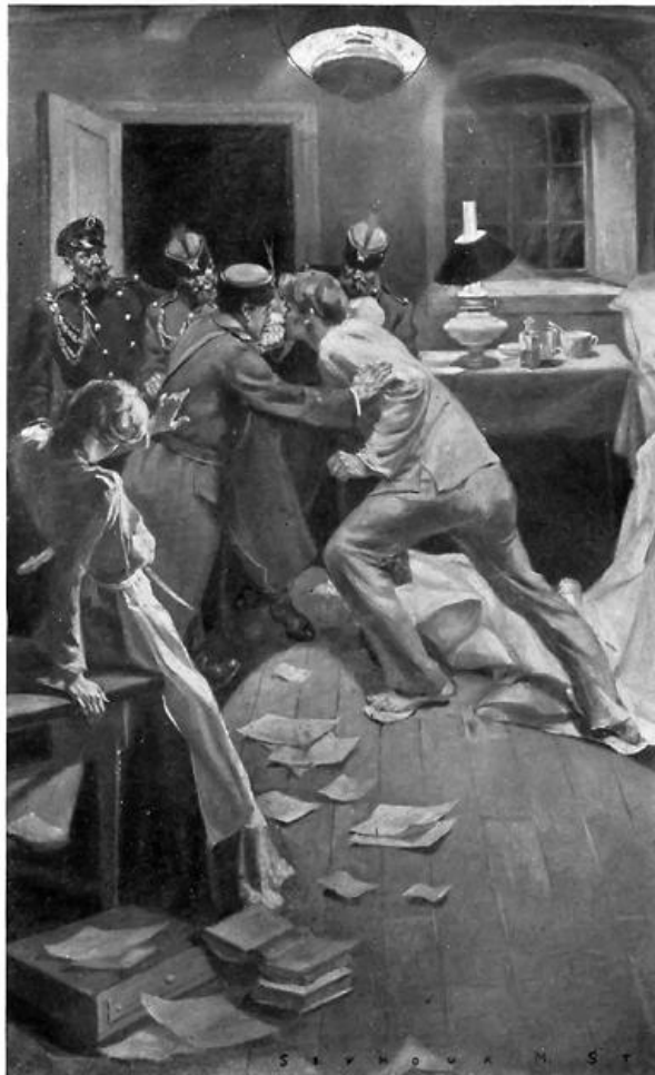
THE ARREST OF A NIHILIST.

How the explosive material was conveyed from Paris to Russia is a mystery which was never successfully traced by the police. The utmost care was taken at the frontiers to prevent the entrance of any suspicious substance. For a year or two even the tea that came on the backs of camels from China was carefully searched, while all travellers were closely examined, and all articles coming from Western Europe were almost pulled to pieces in the minuteness of the scrutiny. The explosive is said to have looked like golden syrup, and to have been sweet to the taste, though acrid in its after-effects. A drop or two let fall on a hot stove flashed up in a brilliant sheet of flame, though without smell or noise.