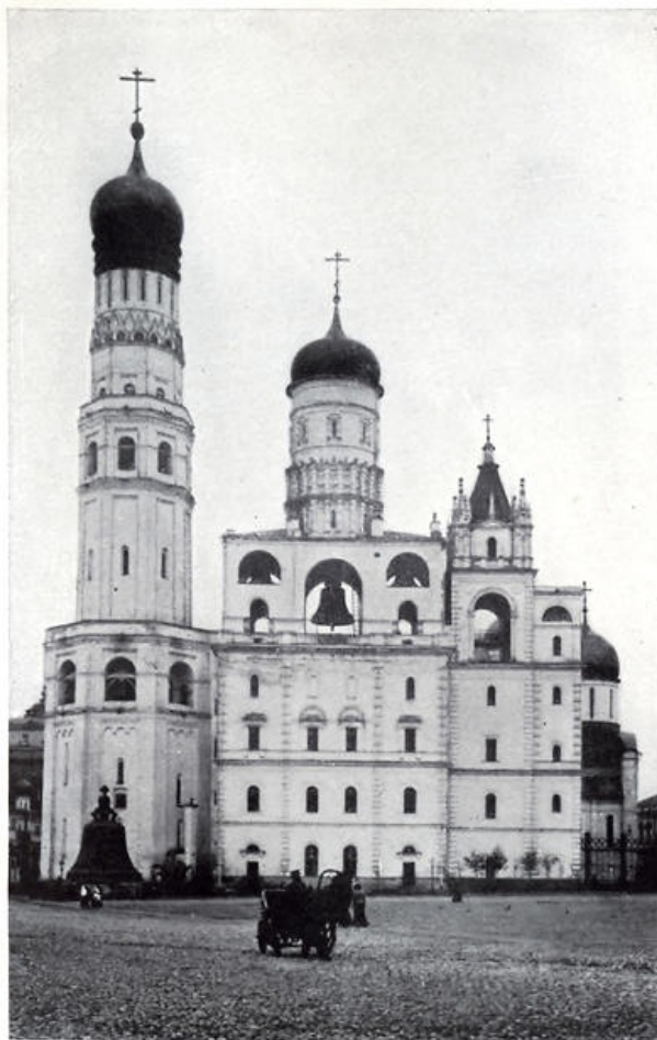
CHURCH AND TOWER OF IVAN THE GREAT.

Yet all the excesses of Ivan did not turn the people against him. He assumed the manner of one inspired, claiming divine powers, and all the injuries and degradation which he inflicted upon the people were accepted not only with resignation but with adoration. The Russians of that age of ignorance seem to have looked upon God and the czar as one, and submitted to blows, wounds, and insults with a blind servility to which only abject superstition could have led.