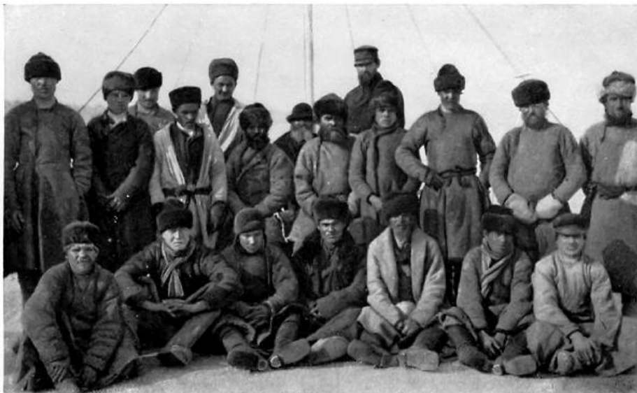
GROUP OF SIBERIANS.

The exiles are divided into two classes, those who lose all and those who lose part of their rights. Of a convict of the former class neither the word nor the bond has any value: his wife is released from all duty to him, he cannot possess any property or hold any office. In prison he wears convict clothes, has his head half shaved, and may be cruelly flogged at the will of the officials, or murdered almost with impunity. Those deprived of partial rights are usually sent to Western Siberia; those deprived of total rights are sent to Eastern Siberia, where their life, as workers in the mines, is so miserable and monotonous that death is far more of a relief than something to be feared.