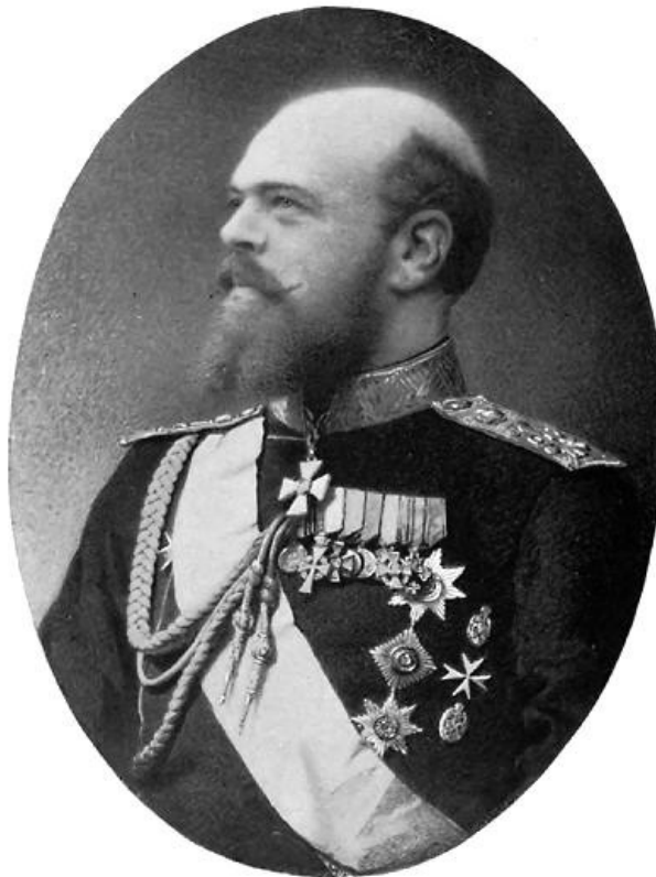
ALEXANDER III., CZAR OF RUSSIA.

It will suffice to say, in conclusion, that shortly after these events Peter became the reigning czar, and turned from sport to earnest. Sophia had enjoyed so long the pleasure of ruling that her ambition grew with its exercise, and she sought to retain her position as long as possible. It is even said that she laid a plot to assassinate Peter, so that only the feeble Ivan should be left. The boy, told that assassins were seeking him, fled for his life. His fright seems to have been groundless, but it made him an undying enemy of his sister. The affair ended in the bulk of the nobility and soldiery turning to his side and in Sophia being obliged to leave the throne for a convent, where she spent the remainder of her life in the misery of strict seclusion.