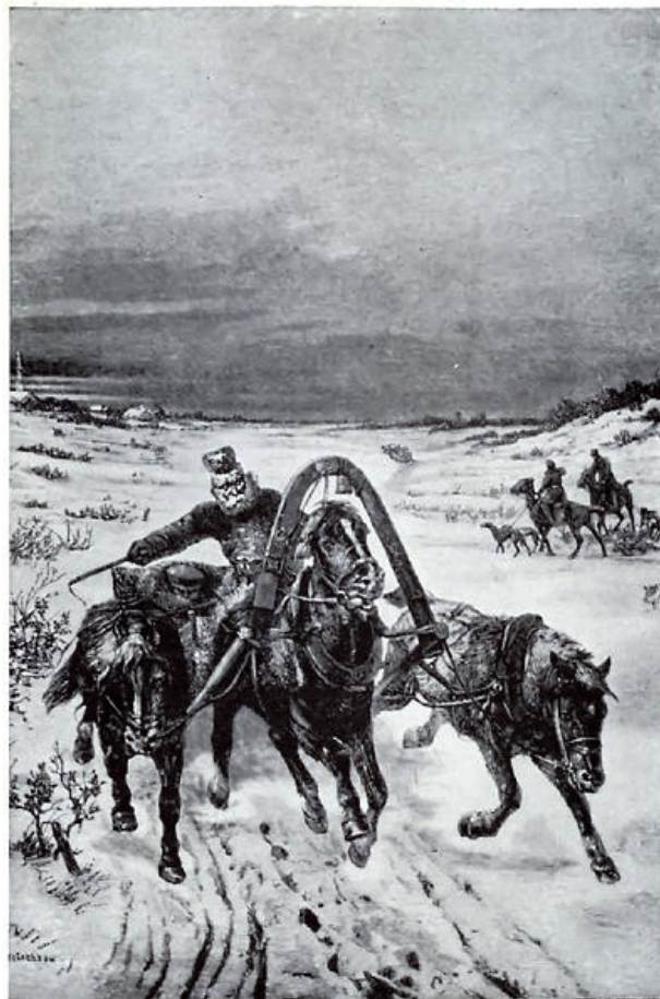
SLEIGHING IN RUSSIA.

As yet Peter had no design of making St. Petersburg the capital of his empire. That conception seems not to have come to him until after the crushing defeat of the Swedish monarch Charles XII. at the battle of Pultowa. And indeed it was not until 1817 that it was made the capital. It was