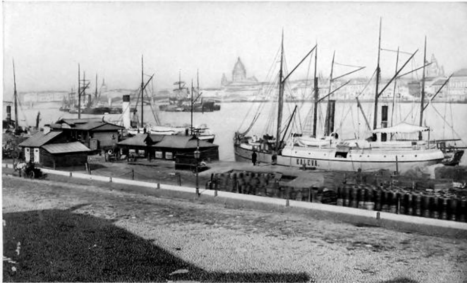
ST. PETERSBURG HARBOR, NEVA RIVER.

In truth, he fell in love with the spot, though what he saw in it to admire is not so clear. In summer mud ruled there supreme: the very name Neva is Finnish for "mud." During four months of the year ice took the place of mud, and the islands and stream were fettered fast. The country surrounding was largely a desert, its barren plains alternating with forests whose only inhabitants were wolves. Years after the city was built, wolves prowled into its streets and devoured two sentries in front of one of the government buildings. Moscow lay four hundred miles away, and the country between was bleak and almost uninhabited. Even to-day the traveller on leaving St. Petersburg finds himself in a desert. The great plain over which he passes spreads away in every direction, not a steeple, not a tree, not a man or beast, visible upon its bare expanse. There is no pasturage nor farming land. Fruits and vegetables can scarcely be grown; corn must be brought from a distance. Rye is an article of garden culture in St. Petersburg, cabbages and turnips are its only vegetables, and a beehive there is a curiosity.