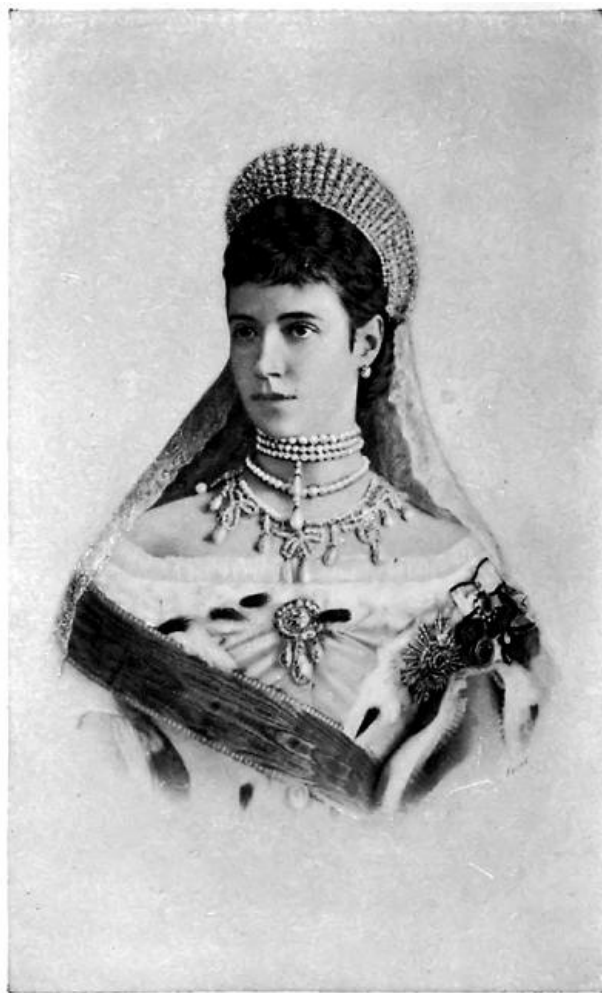
DOWAGER CZARINA OF RUSSIA.

It is now more than three hundred years since the Cossack robber Yermak invaded Siberia, and more than two centuries since that vast section of Northern Asia was added to the Russian empire. The great river Amur, flowing far through Eastern Siberia to the Pacific, was discovered in 1643 by a party of Cossack hunters, who launched their boats on this magnificent stream and sailed down it to the sea. It was Chinese soil through which it ran, its waters flowing through the province of Manchuria, the native land of the emperors of China.