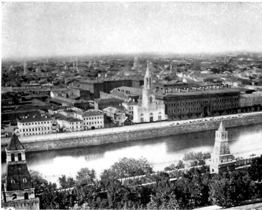
GENERAL VIEW OF MOSCOW.

In the end the princes of Moscow became supreme. They grew rich, and were able to keep up a regular army, that chief tool of despotism. The crown lands alone gave them dominion over three hundred thousand subjects. The time was coming in which they would be the absolute rulers of all Russia. But before this could be accomplished the power of the khans must be broken, and the first step towards this was taken by the great Dmitri Donskoi, who became grand prince of Moscow in 1362.