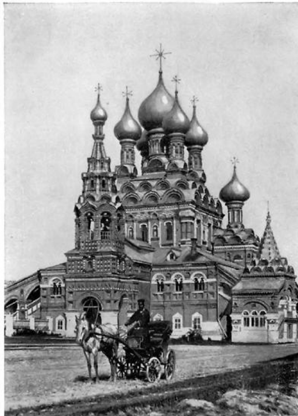
CATHEDRAL AT OSTANKINO, NEAR MOSCOW.

With all his faults, Vladimir deserved the title of Great which his country has given him. He put down the turbulent tribes, planted colonies in the desert, built towns, and embellished his cities with churches, palaces, and other buildings, for which workmen were brought from Greece. Russia grew rapidly under his rule. He established schools which the sons of the nobles were made to attend. And though he was but a poor pattern for a saint, he had the merit of finding Russia pagan and leaving it Christian.