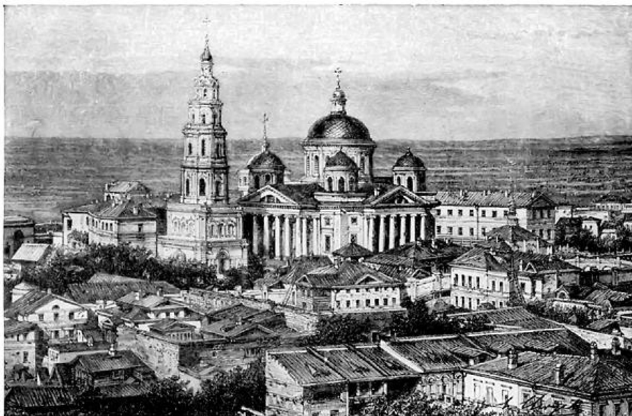
THE CITY OF KASAN.

He now fled to the Volga, wasting the land as he went, burning the crops and villages, and leaving desolation in his track. Men came in numbers to replace those he had lost, and an army of twenty thousand was soon again under his command. With these he surprised and routed a Russian force and took several forts on the Volga, while the German colonies of Moravians which had been established upon that stream, and were among the most industrious inhabitants of the empire, suffered severely at his hands. In the town of Saratof he murdered all whom he met.