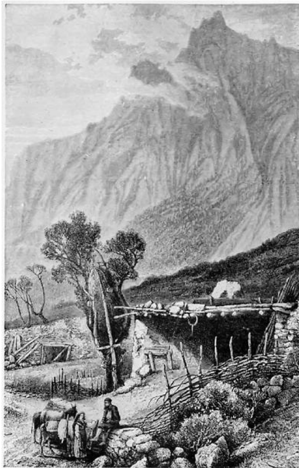
MOUNT ST. PETER, CRIMEA.

THE Crimean War, brief as was the interval it occupied in the annals of time, was one replete with exciting events. And of these much the most brilliant was that which took place on the 25th of October, 1854, the famous "Charge of the Light Brigade," which Tennyson has immortalized in song, and which stands among the most dramatic incidents in the history of war. It was truthfully said by one of the French generals who witnessed it, "It is magnificent, but it is not war." We give it for its magnificence alone.