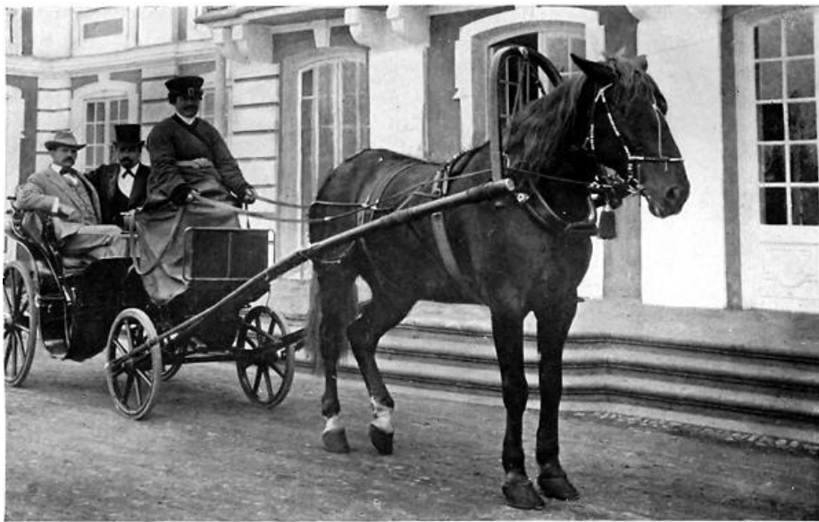
A RUSSIAN DROSKY.

Five miles from the city they met two others of the conspirators, devoured with anxiety. Changing to the new coach, the party drove in at breakneck pace, and halted before the barracks of the Ismailofsky regiment, with which the conspirators had been at work.