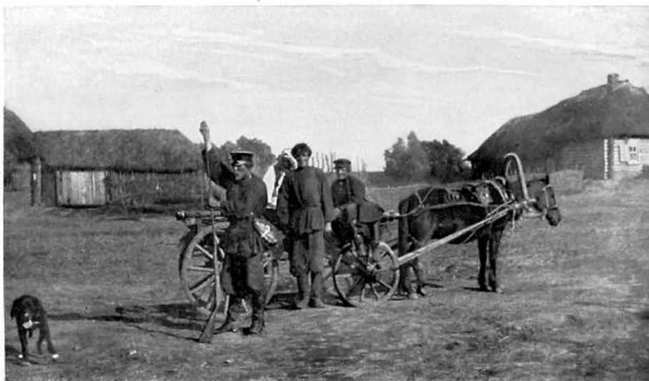
SCENE ON A RUSSIAN FARM.

The Dnieper reached, the empress and her train passed down that river in fifteen splendid galleys, with the pomp of a triumphal procession. It was now the month of May, and the banks of the river showed the same signs of prosperity as had the sides of the road. At Kaidack the emperor Joseph met the empress, having reached Kherson in advance and gone north to anticipate her coming. He accompanied her down the stream, looking with her on the show of prosperity and populousness which delighted her inexperienced eyes, and smiling covertly at the