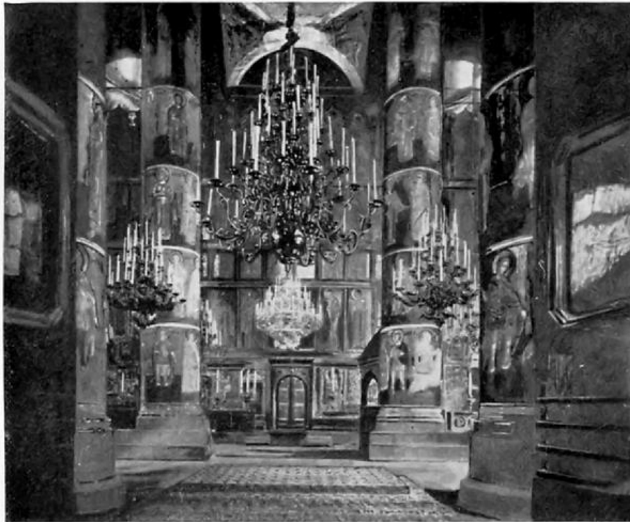
CHURCH OF THE ASSUMPTION, MOSCOW, IN WHICH THE CZAR IS CROWNED.