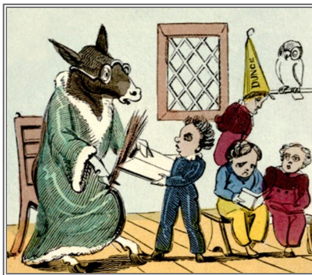
THE DONKEY TURNED SCHOOLMASTER. page 14.