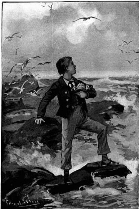
MY BOAT! MY BOAT! WHERE WAS MY BOAT?

I had great hopes that I should find something rare upon the peninsula. The glittering forms that had first induced me to turn my steps in that direction, seemed to gleam still brighter as I drew near. For all that, I did not particularly hasten. I had no fear that the shells would walk off into the water. These were houses whose tenants had long since