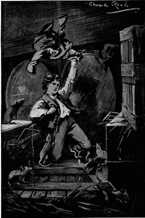
A SWARM OF INTRUDERS.

I think there was some loose board or hollow box by which the sound was produced—for it was very loud to be caused by so small an animal. These noises continued, and I fancied that I also heard the rat passing into my chamber, but still the pattering and scratching were kept up outside, and therefore the animal could not be in.