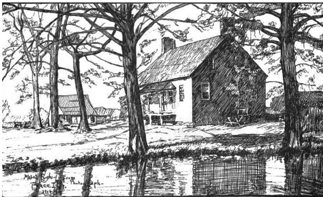
"THE OLD BRICK HOUSE," ON PASQUOTANK RIVER

But tradition has been busy with other occupants of the old house. It is said to have been in colonial days the home of a branch of an ancient and noble English family.