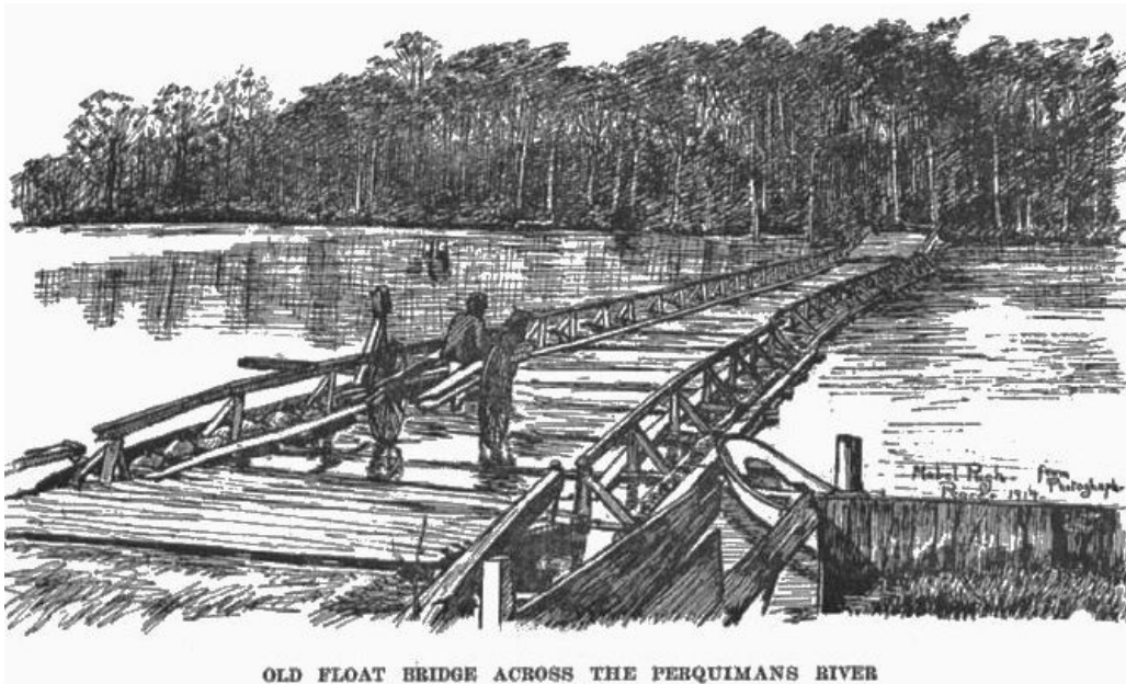
OLD FLOAT BRIDGE ACROSS THE PERQUIMANS RIVER

*** START OF THE PROJECT GUTENBERG EBOOK IN ANCIENT ALBEMARLE ***