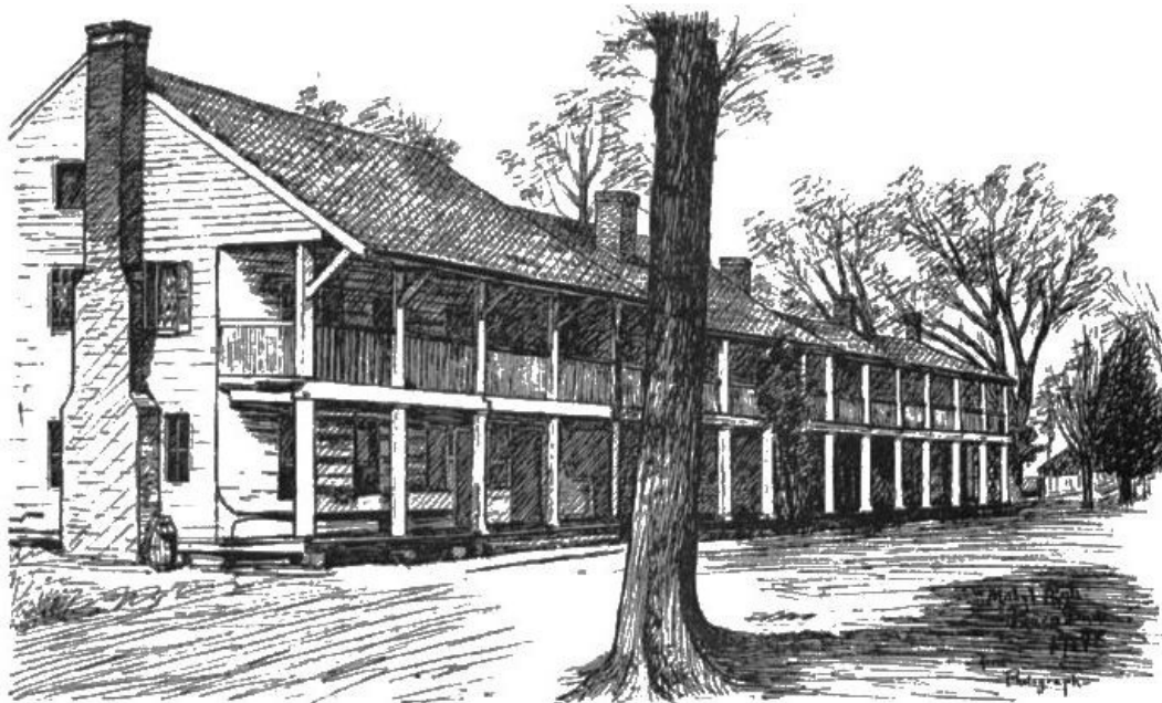
EAGLE TAVERN, HERTFORD, NORTH CAROLINA

Many an illustrious guest the ancient inn has known, and a story cherished by the Hertford people ascribes to the quaint old structure the honor of having on one occasion sheltered beneath its roof the illustrious "Father of his Country," George Washington.