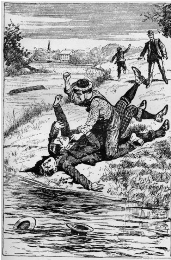
BEN CAUGHT HIS ARM, JERKED HIM ACROSS THE BODY OF RUTHERFORD, AND BELABORED BOTH OF THEM.— P. 12.

But they were too thoroughly vanquished. Their plight was laughable, and yet pitiable. They were coated with mud from head to foot, and their pretty hats, with their polka-dot bands, were gone too far down the river to be recovered. 13