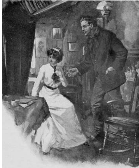
"WOULD YOU BE AFRAID TO SEE WHAT YOU COULD MAKE OF THE PLACE AND ME?" Page 242

"Then," she said, "I'll do what I can, Gregory."