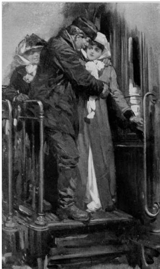
“SHE WAS CONSCIOUS OF A CERTAIN SHRINKING FROM HIS EMBRACE” Page 107

In another moment Hawtreys sprang up on the platform, and his arms were about her. That brought the blood to her face, but she felt none of the thrill that she had expected. Indeed, she was conscious of a certain shrinking from his embrace. He must have lifted her down, for, when she was next aware of the presence of the friends with whom she had traveled, she stood beside the track with Mrs. Hastings, a man whom she supposed to be Mr. Hastings, Winifred and Wyllard about her. Another man also was standing close by, apparently waiting until they noticed him. He was covered with mire, his skin coat was very dilapidated, and Agatha thought that his boots never had been cleaned. His hair, which had evidently been badly cut, straggled out from under his old fur cap.