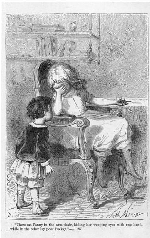
"There sat Fanny in the arm chair, hiding her weeping eyes with one hand, while in the other lay poor Pecksy."—a. 197.

The idea brought him some relief. "I must go back and try and find out," he said to himself. "If I hear Fanny crying, and making a noise, I will run off again. I could not face mamma and granny and the rest of them if they were to know that I had killed Fanny's bird."