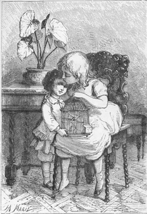
"Will you take it, dear Fanny, and call it Pecksy? I hope it will be a happier little Pecksy than the last."—p. 255.

in future." Such they became, and many a romp had Trusty with the young gentleman.