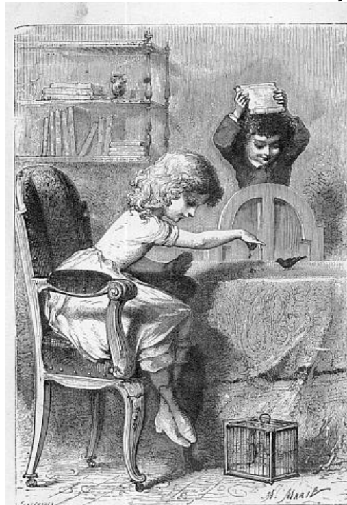
"Rising up suddenly with the book in his hands, the cruel boy let it fall directly down on the little bird."—p. 195.

Fanny had made him go through his performance once or twice, for she had wisely put down very small crumbs