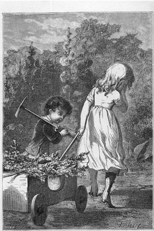
"The bird being placed in due form on its bier, they set forth, Fanny drawing the hearse and Norman carrying the hoe."—p. 205.

"A spade or a pickaxe is rather too much for you to handle, my laddie," he answered, "but you shall have a hoe, which will be big enough to dig a little birdie's grave."