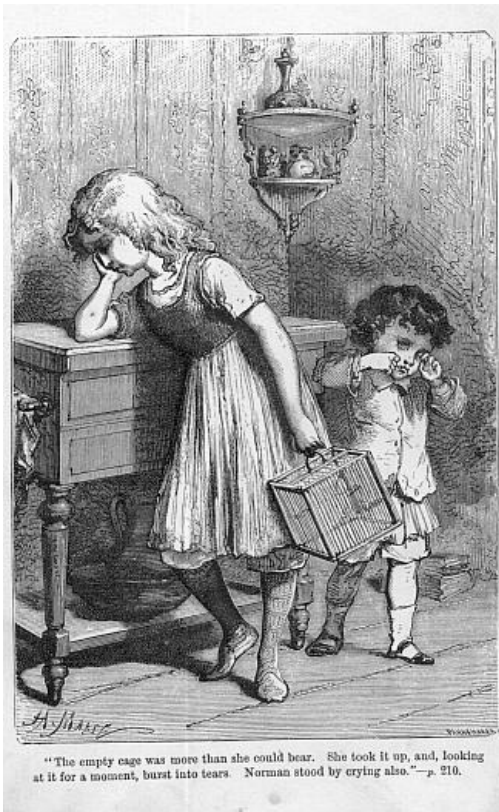
"The empty cage was more than she could bear. She took it up, and, looking at it for a moment, burst into tears. Norman stood by crying also."—p. 210.

on one which her mamma had brought from France, like that of a peasant girl, which was well suited for wandering about the hills and moors.