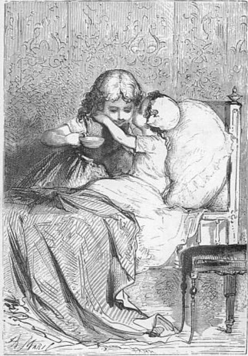
“He threw his arms round her neck. ‘You dear, kind sister, how good you are to me.’”—p. 250.

What an active attentive little nurse did Fanny make, and how pleasantly and gently she talked to Norman, telling him all sorts of things which she could think of, to interest him. She daily brought him his