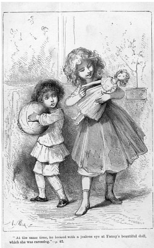
"At the same time, he looked with a jealous eye at Fanny's beautiful doll, which she was caressing."—p. 42.

Norman had been eyeing the doll with no pleasant feelings; he did not like that his sister should receive a present when he thought that there was none for him.