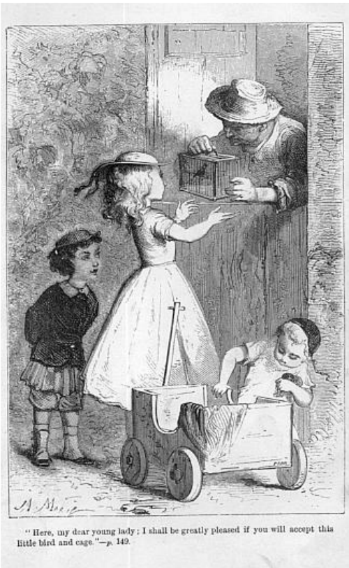
"Here, my dear young lady; I shall be greatly pleased if you will accept this little bird and cage."—p. 149.

come in themselves, but said they would wait till you returned. I think the young gentleman would like some of the fruit, for he looked at it when his sister gave it to me. Can I run out and offer it to him? Perhaps, though, he will be offended, for he looks very proud."