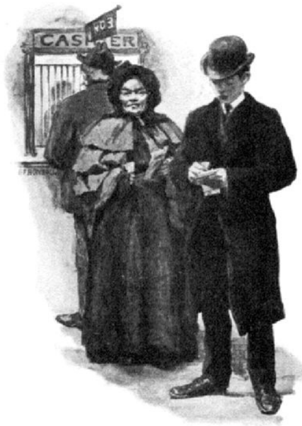
"HE MADE SEVERAL RAPID CALCULATIONS ON THE BACK OF THE ENVELOPE."