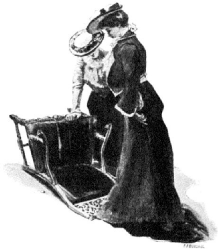
"IT WAS THAT UNLUCKY GOLD COIN."

Philippa, watching his face as he read, came up to him when he had finished, and put a hand on each shoulder.