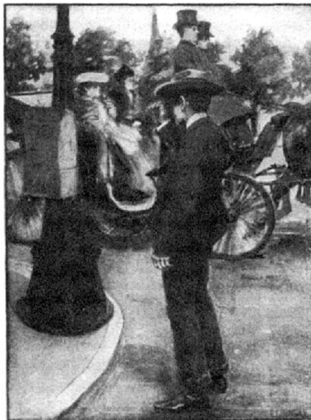
"HIS HAND WENT UP INVOLUNTARILY TOWARD HIS HAT."

"Just what I might have expected!" muttered Alec, thinking she purposely avoided him. His teeth were set and his face white with mortification. But in