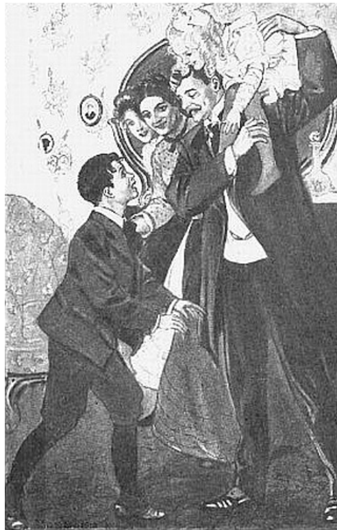
SEE, JOEL, I'M ALL FIXED UP NICE, LAUGHED PHRONSIE FROM HER PERCH.

"See, Joel, I'm all fixed up nice," laughed Phronsie from her perch.