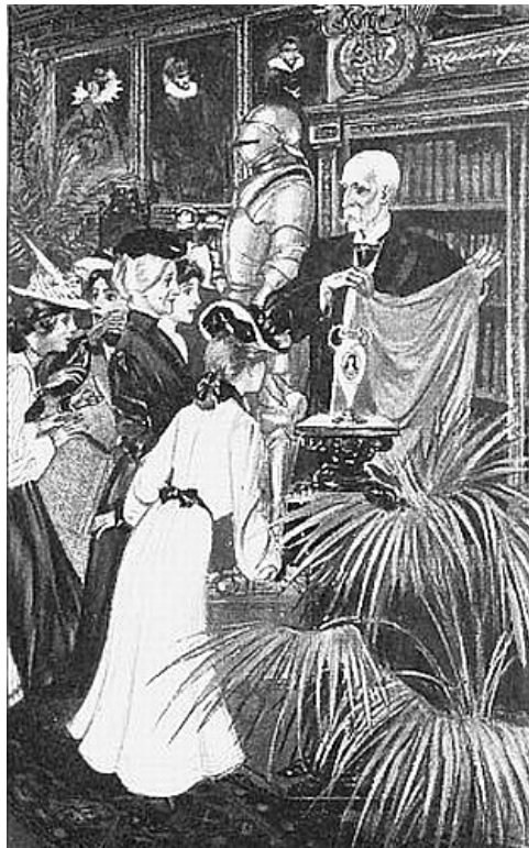
THERE STOOD THE LITTLE VASE, PRESENTING AS BRAVE AN APPEARANCE AS IN ITS FIRST PERFECTION.

Mr. Clemcy lifted this, and took it off carefully. There stood the little vase, presenting as brave an appearance as in its first perfection.