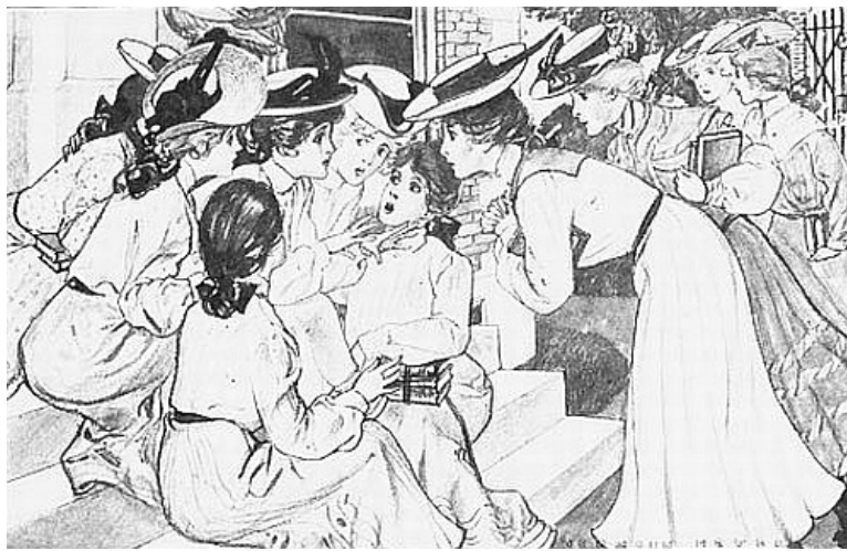
AND SHE TOLD THEM THE WHOLE STORY AS FAST AS SHE COULD.

101 "Oh, yes, Miss Anstice," cried Polly, hopping up so quickly she nearly overthrew some of the bunch of girls.