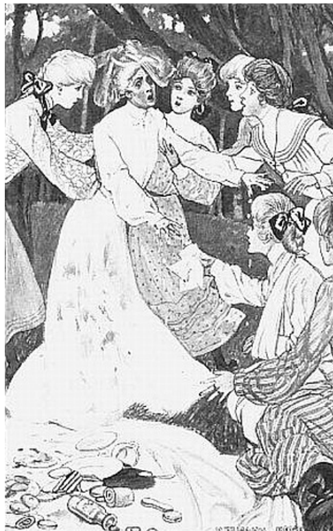
"I NEVER DID REGARD PICNICS AS PLEASANT AFFAIRS," GASPED MISS ANSTICE.

207 "Alexia, keep your seat." Miss Anstice turned on her. "It is quite bad enough, without your heedless fingers at work on it."