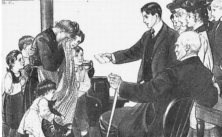
"AND SO WE HAD A LITTLE ENTERTAINMENT, AND SOLD THE TICKETS, AND HERE IS OUR GIFT!"

"Just see Polly Pepper!" exclaimed Alexia, with a grimace. "Why doesn't she drop that dirty old cat?"