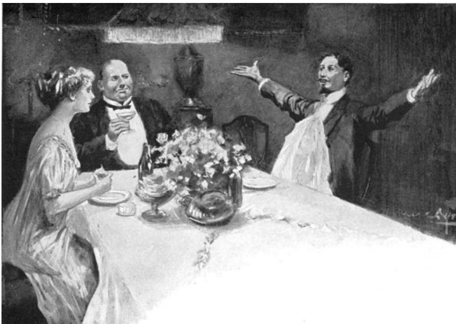
"AH! THE PICTURES," CRIED ARISTIDE, WITH A WIDE SWEEP OF HIS ARMS

"I have a snail farm," said Aristide. "You never saw such interesting little animals. They are so intelligent. If you're kind to them they come and eat out of your hand."