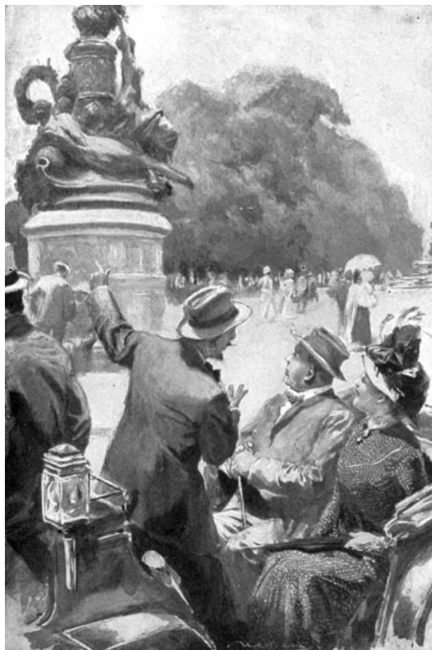
HE MIGHT AS WELL HAVE POINTED OUT THE MARVELS OF KUBLA KHAN'S PLEASURE-DOME TO A COUPLE OF

"No," said he, solemnly. "I disapprove of Popish interiors. Take us to the next place."