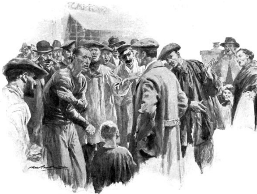
I HAD KNOCKED HIM DOWN ON PURPOSE. HE WAS CRIPPLED FOR LIFE