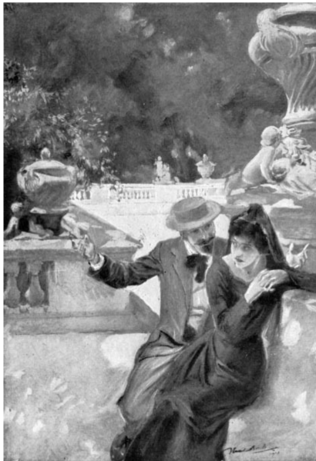
"MADAME," SAID ARISTIDE, "YOU ARE ADORABLE, AND I LOVE YOU TO DISTRACTION"

"Monsieur," she said, after a short pause, "you look good and loyal. I will tell you what is the matter. My husband accuses me wrongfully, although I know that appearances are against me. He only allows me in the house on sufferance, and is taking measures to procure a divorce."