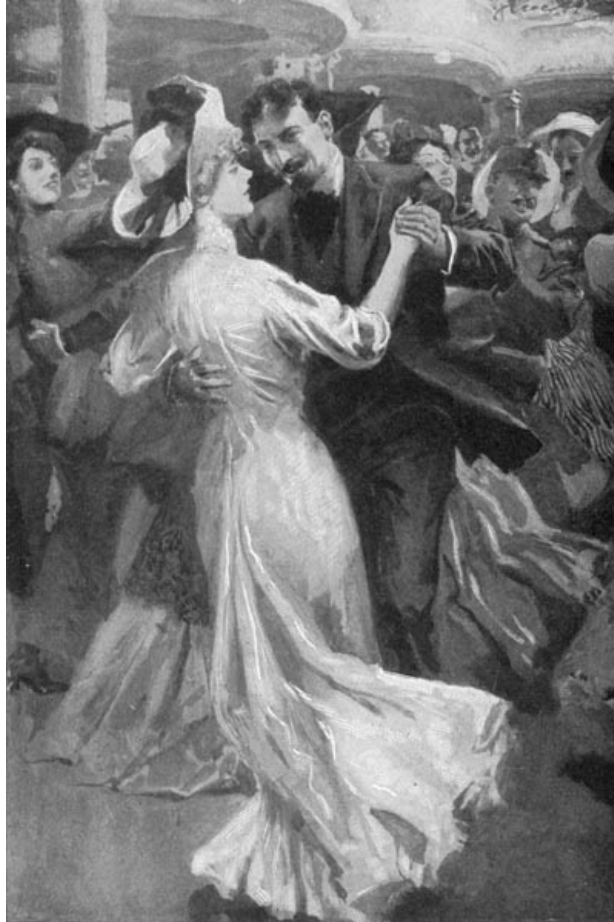
FLEURETTE DANCED WITH ARISTIDE, AS LIGHT AS AN AUTUMN LEAF TOSSED BY THE WIND

"A fortnight ago she was being killed in a Bloomsbury boarding-house. There were two of 'em—she and a girl called Carrie. I used to call 'em Fetch and Carrie. This one was Fetch. Well, she fetched me, didn't you, old girl? And now you're Mrs. Reginald Batterby, living at your ease, eh?"