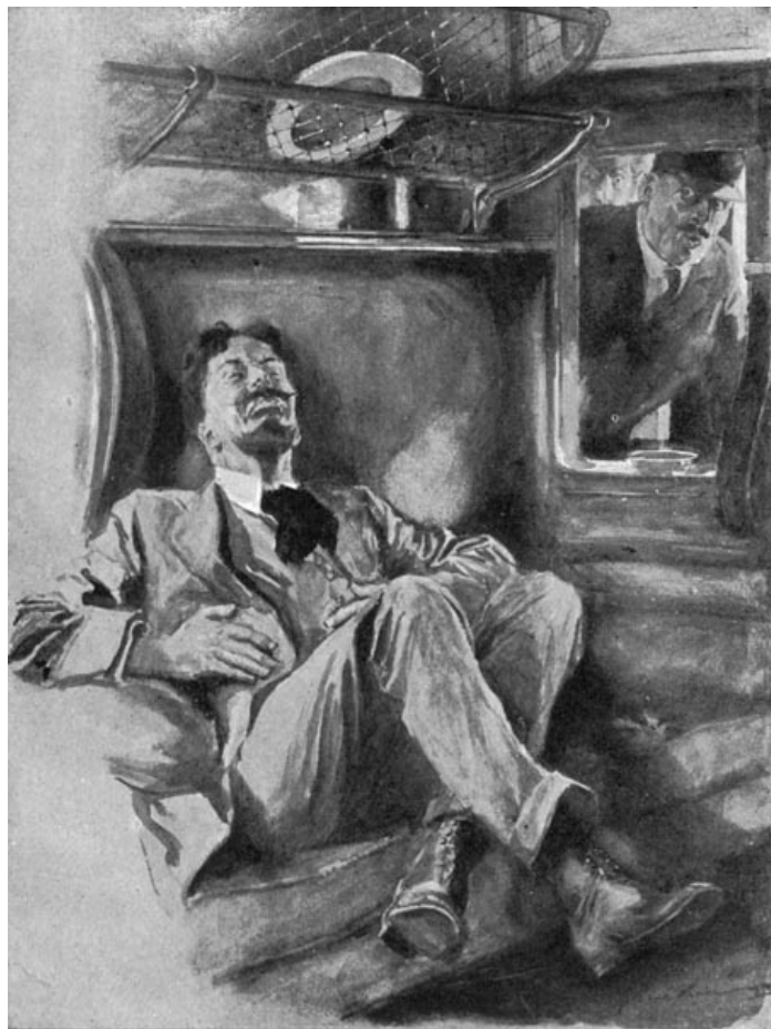
HE BURST INTO SHRIEKS OF LAUGHTER

Early the next morning Aristide started on his quest, without informing the good Bocardon of his intentions. He would go straight to Avignon, as the more likely place. Inquiries at the various hotels would soon enable him to hunt down his quarry; and then—he did not quite know what would happen then—but it would be something picturesque, something entirely unforeseen by Bondon, something to be thrillingly determined by the inspiration of the moment. In any case he would wipe the stain from the family escutcheon. By this time he had convinced himself that he belonged to the Bocardon family.