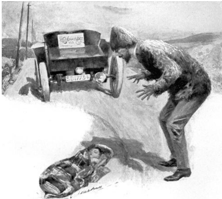
BETWEEN THE FOLDS OF THE BLANKET PEEPED THE FACE OF A SLEEPING CHILD

Suddenly, however, he became aware of a small black spot far ahead in the very middle of the unencumbered track. As he drew near it looked like a great stone. He swerved as he passed it, and, looking, saw that it was a bundle wrapped in a striped blanket. It seemed so odd that it should be lying there that, his curiosity being aroused, he pulled up and walked back a few yards to examine it. The nearer he approached the less did it resemble an ordinary bundle. He bent down, and lo! between the folds of the blanket peeped the face of a sleeping child.