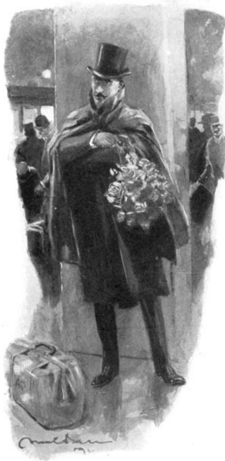
STANDING ON THE ARRIVAL PLATFORM OF EUSTON STATION

"Then, sir, Mr. Smith has sent the carriage for you."