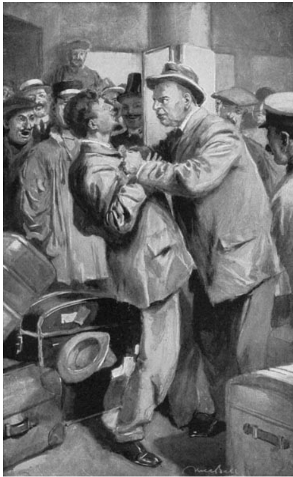
MR. DUCKSMITH SEIZED HIM BY THE LAPELS OF HIS COAT

"You swear that?" asked Aristide, with lightning quickness.