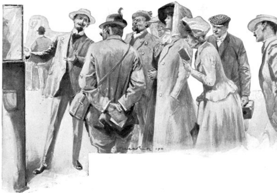
HE MUST HAVE DEALT OUT PARALYZING INFORMATION

Aristide, letting loose his swift imagination, explained copiously, and hypnotized M. Bocardon with his glittering eye, until he had assured to himself a means of livelihood. From that moment he became the familiar genius of the hotel. Scorning the title of "guide," lest he should be associated in the minds of the guests with the squalid scoundrels who infest the Boulevard, he constituted himself "Directeur de l'Agence Pujol." An obfuscated Bocardon formed the rest of the agency and pocketed a percentage of Aristide's earnings, and Aristide, addressed as "Director" by the Anglo-Saxons, "M. le Directeur" by the Latins, and "Herr Direktor" by the Teutons, walked about like a peacock in a barn-yard.