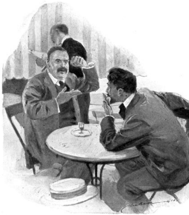
"THE VILLAIN WAS A TRAVELLER IN BUTTONS—BUTTONS!"

It was a crude, flaming, reprehensible, and entirely damning epistle. Aristide turned cold, shivering at the idea of the superb and dainty Zette coming in contact with such abomination. He hated Bondon with a murderous hate. He drank a great gulp of absinthe and wished it were Bondon's blood. Great tears rolled down Bocardon's face, and gathering at the ends of his scrubby moustache dripped in splashes on the marble table.