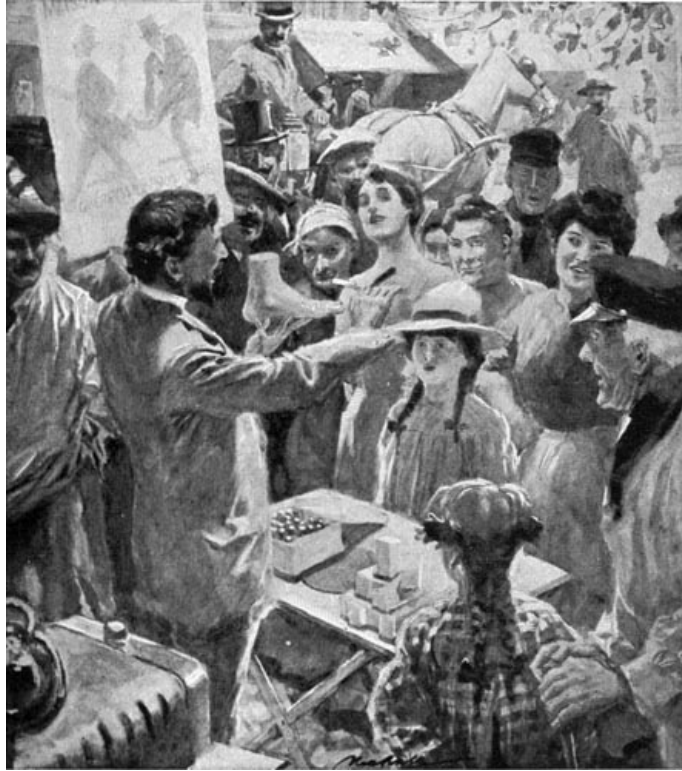
HE DEMONSTRATED THE PROPER APPLICATION OF THE CURE

" Mon Dieu! " she said. "To think that there are Christians who dress their children like this!" She sighed exhaustively, and, holding the grotesque infant close to her breast, disappeared indignantly to administer the very greatly needed motherment.