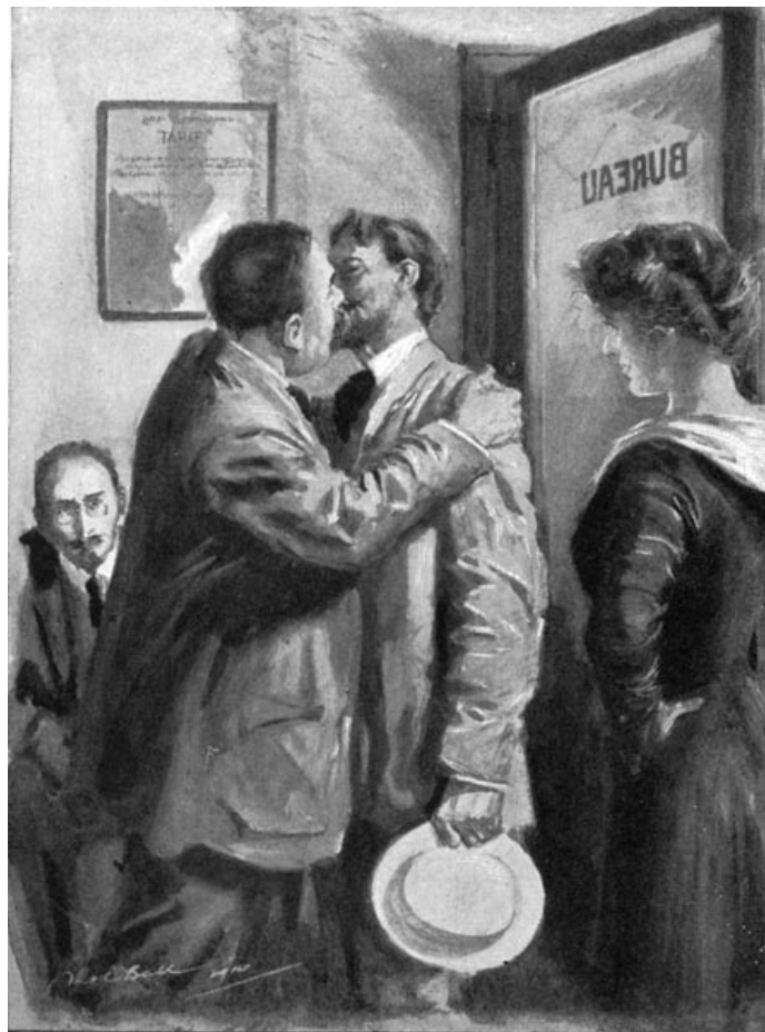
"AND YOU!" SHOUTED BOCARDON, FALLING ON ARISTIDE; "I MUST EMBRACE YOU ALSO"

"Then that letter was not for my wife?" said Bocardon, who was not quick-witted.