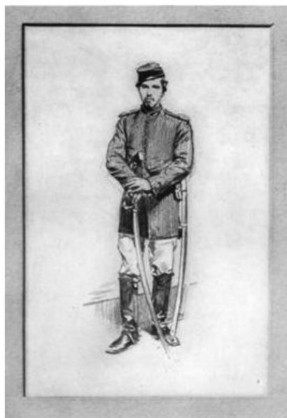
"Jim Purdy, taken the day he left for the army"

Miss Larrabee came down the lilac-bordered walk from the stately old brick house, carrying a great bouquet of sweet peas and nasturtiums and poppies and phlox, a fleeting memory of some association she had in her mind of Uncle Jimmy Purdy and Aunt Martha kept tantalising her. She could not get it out of the background of her consciousness, and yet it refused to form itself into a tangible conception. It was associated vaguely with her own grandmother, as though, infinite ages ago, her grandmother had said something that had lodged the idea in the girl's head.