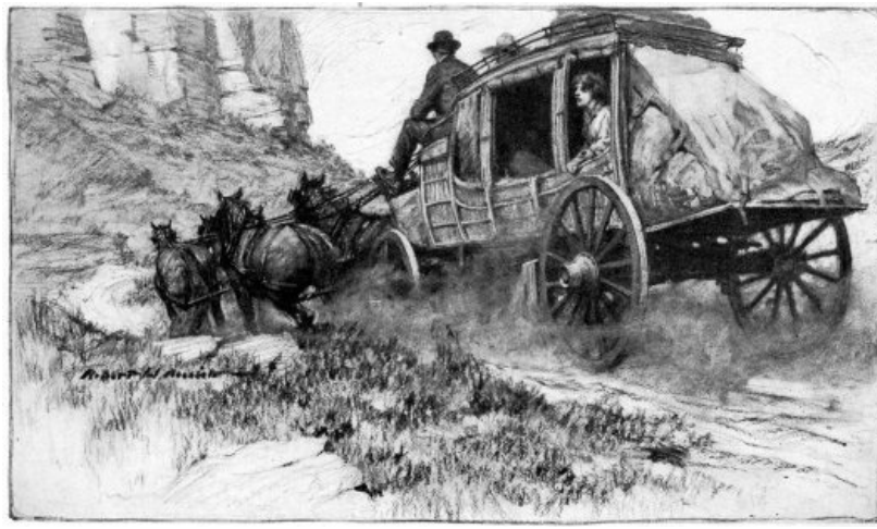
THE GIRL BEHIND HIM WAS A WONDROUS PART OF THIS WILD AND UNACCOUNTABLE COUNTRY

Meanwhile the stage rose and fell over the gigantic swells like a tiny boat on a monster sea, while the sun blazed ever more fervently from the splendid sky, and the hills glowed with ever-increasing tumult of color. Through this land of color, of repose, of romance, the young traveler rode, drinking deep of the germless air, feeling that the girl behind him was a wondrous part of this wild and unaccountable country. 7