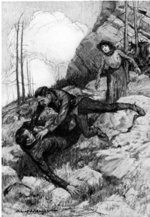
THE SLENDER YOUTH WENT DOWN BEFORE THE BIG RANCHER AS THOUGH STRUCK BY A CATAPULT

Belden snarled between his teeth: "I told you I'd kill you, and I will."