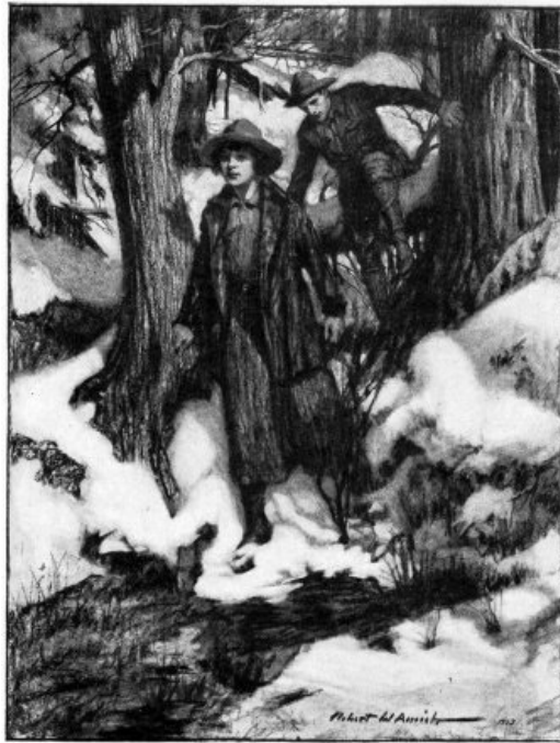
SHE FOUND HERSELF CONFRONTED BY AN ENDLESS MAZE OF BLACKENED TREE-TRUNKS

He bravely reassured her: "I'm not defeated, I'm just tired. That's all. I can go on."