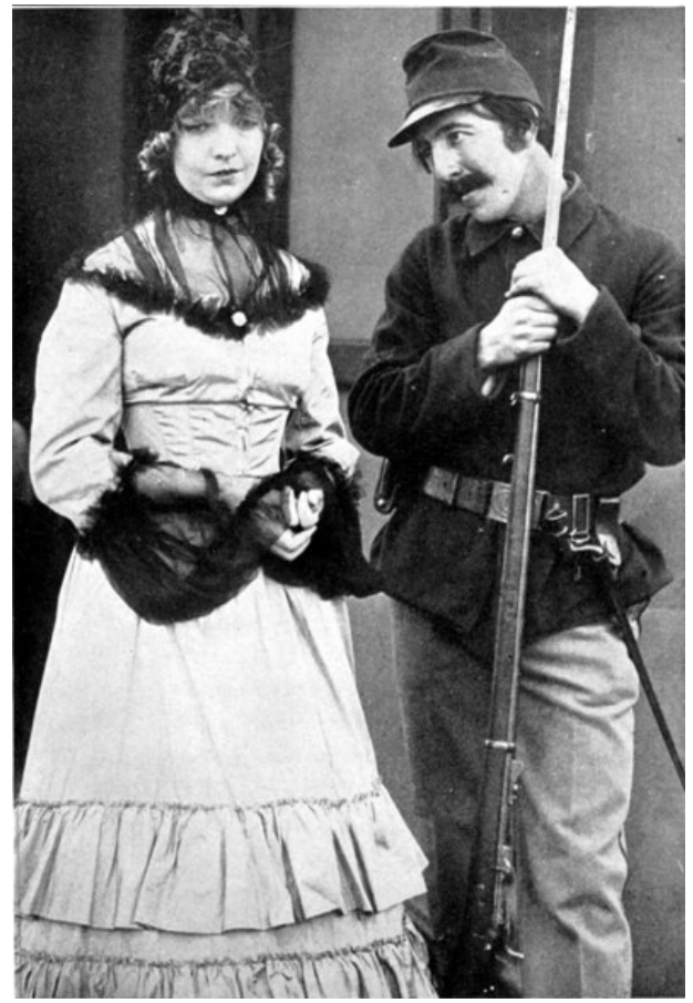
LILLIAN GISH AS ELSIE, AND THE SENTINEL.

"Your egotism, for one thing. The air with which you calmly select what pleases your fancy. Northern men are bad enough—the insolence of a Southerner is beyond words!"