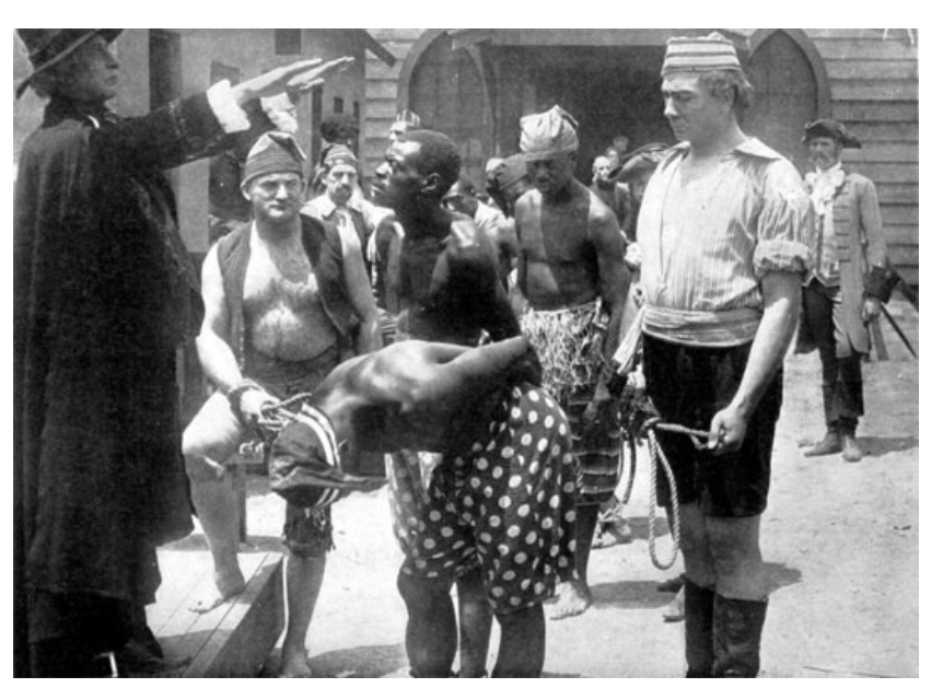
THE BLACK MASTERS OF THE SOUTH DURING RECONSTRUCTION.

"My boy, we will pray that God may never let us live to see the day!"