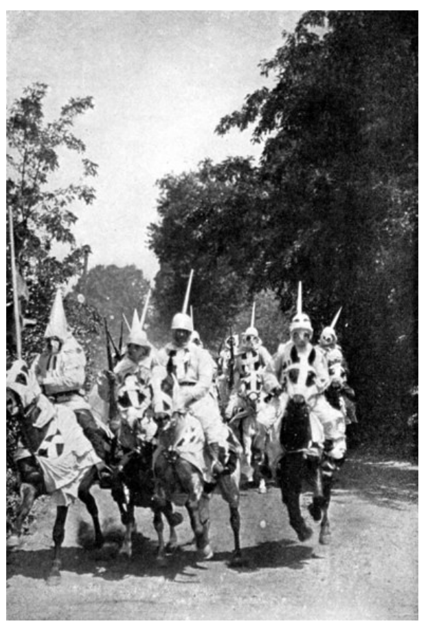
THE REIGN OF THE KLAN

The Illustrations Shown in This Edition Are Reproductions of Scenes from the Photo-Play of "The Birth of a Nation" Produced and Copyrighted by The Epoch Producing Corporation, to Whom the Publishers Desire to Express Their Thanks and Appreciation for Permission to Use the Pictures.