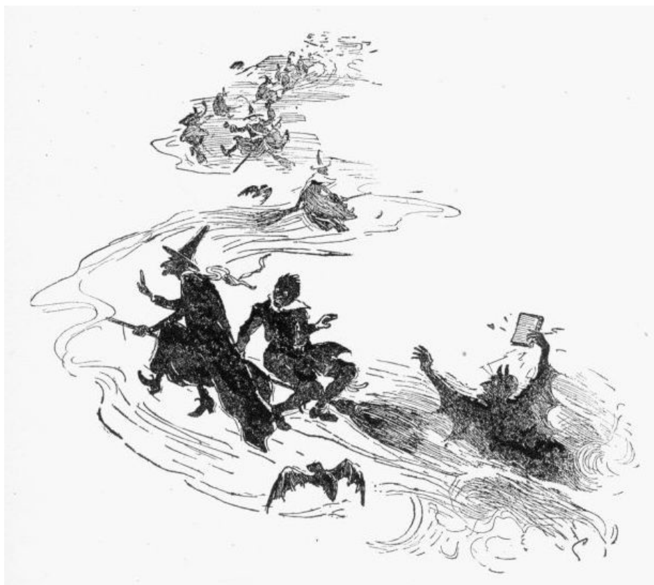
"WE ALL ROSE IN THE AIR ON BROOMSTICKS."

"Be going, Johnnie, I will give you sore bones ere the cock crows."