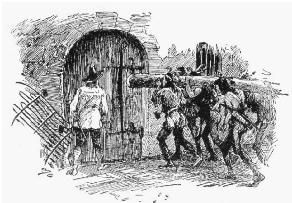
THE JAIL TREMBLED TO ITS VERY CENTRE.

The terrified jailer tumbled out of his bed, only to find himself seized and held by a pair of painted sons of the forest. Others who attempted to interfere were seized and held in grasps of iron.