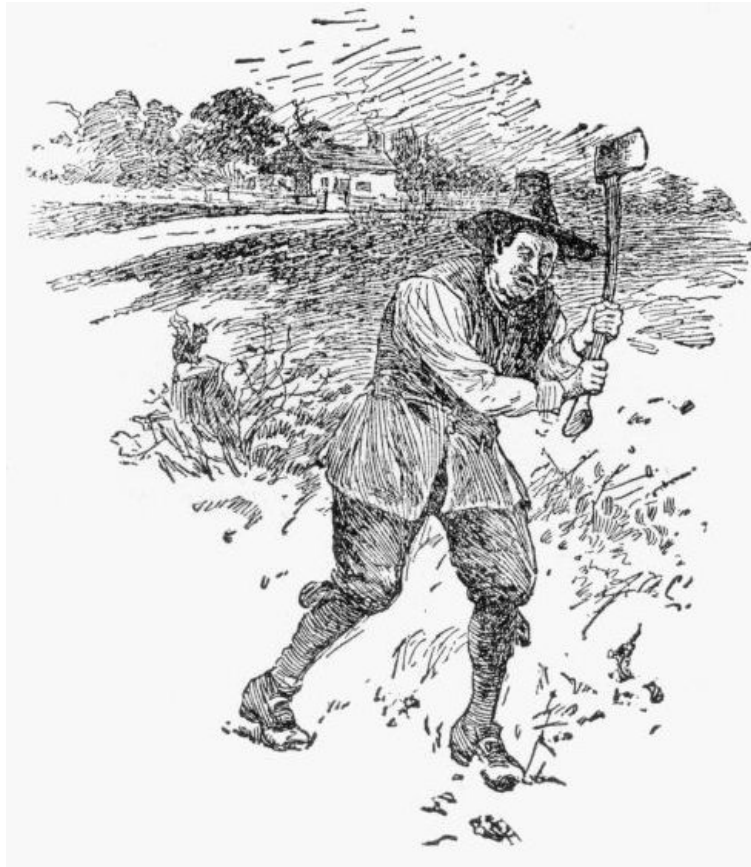
"ITS MOTIONS WERE QUICKER THAN THOSE OF MY AXE."

"On going a little further, there appeared unto me a black puppy, somewhat bigger than the first, but as black as a coal. Its motions were quicker than those of my axe; it flew at my belly, and away; then at my throat; so, over my shoulder one way, and then over my shoulder another way. My heart now began to fail me, and I thought the dog would have torn my throat out; but I recovered myself and called upon God in my distress; and, naming the name of Jesus Christ, it vanished away at once."