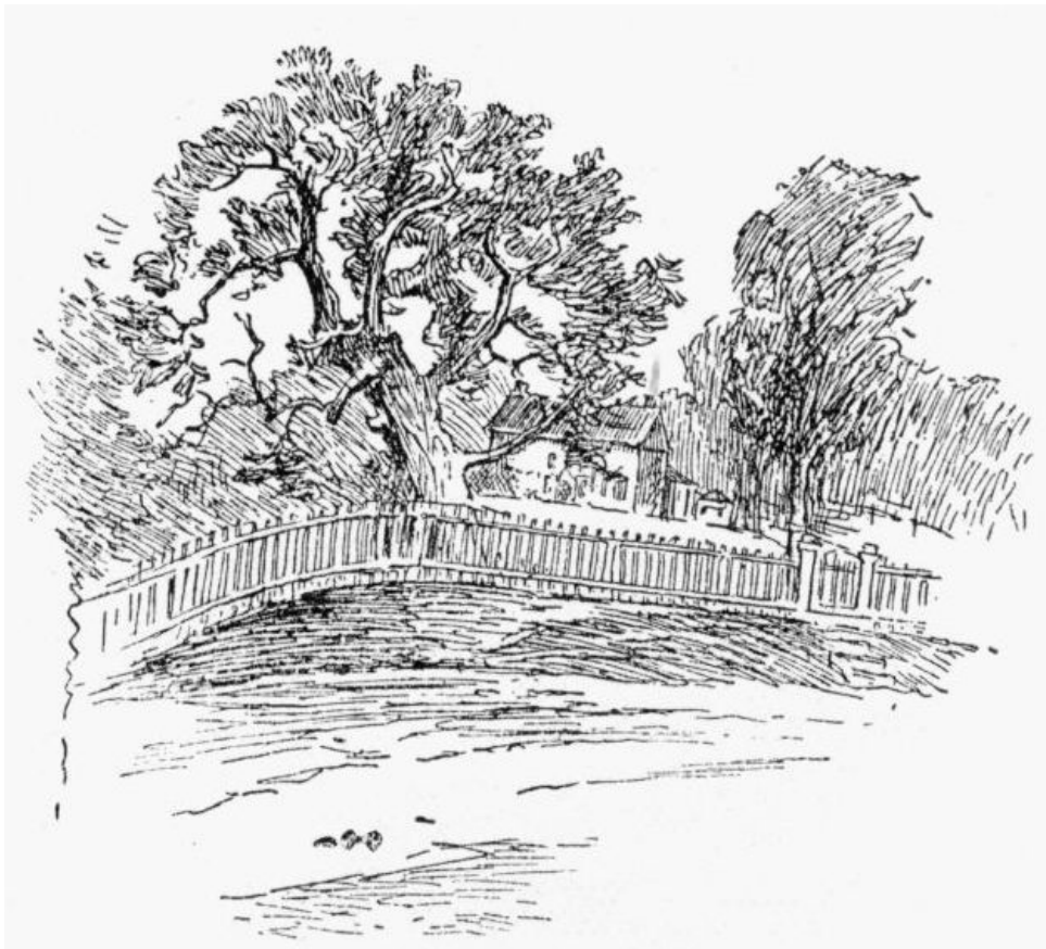
THE CHARTER OAK.

"Stand a little way off, Charles," commanded the captain. "And watch to see that no one is observing me."