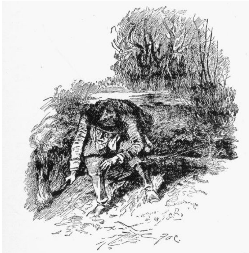
SEIZING A FIREBRAND, HE SEARCHED FOR THE PRINT OF A CLOVEN HOOF.

"Away! begone! The whole armor of God be between me and you."