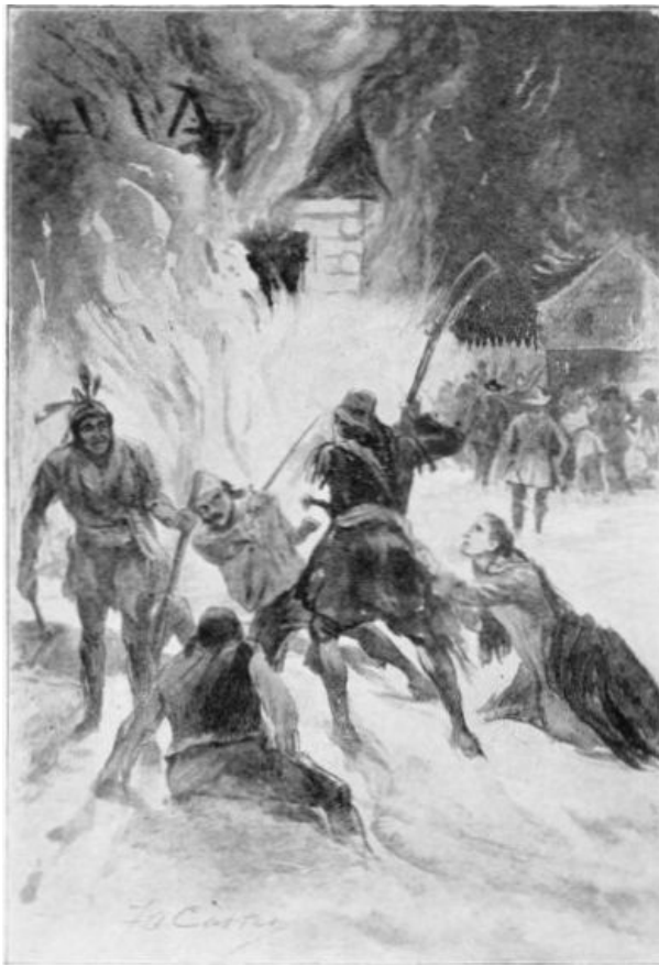
NAUGHT WAS TO BE SEEN, SAVE MASSACRE AND PILLAGE ON EVERY SIDE.

Owing to the wretched condition of the roads and the deep snows, news of the massacre did not reach the great Mohawk castle, only seventeen miles distant, for two days. On receipt of the terrible news, an armed party set out at once in pursuit of the foe. After a long tedious march through the snow and forest, they came upon their rear, and a furious fight followed, in which about twenty-five of them were killed and wounded.