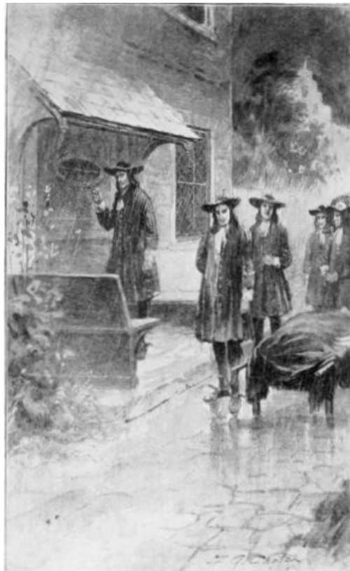
EIGHT MEN, BEARING LITTERS, WERE AT THE DOOR. ALL WERE DRIPPING WITH WATER.