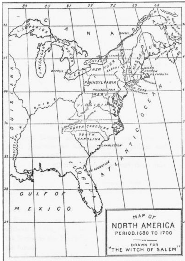
MAP OF NORTH AMERICA

The Indians and the Waters brothers were engaged in a consultation. Charles took no part in the consultation, for he knew nothing to advise. Then the Indians accompanied them for a few miles through the woods. The forest was dark and sombre, and they had only the silent stars to light their path, until the tardy moon, rising at a late hour, filled the landscape with silver light.