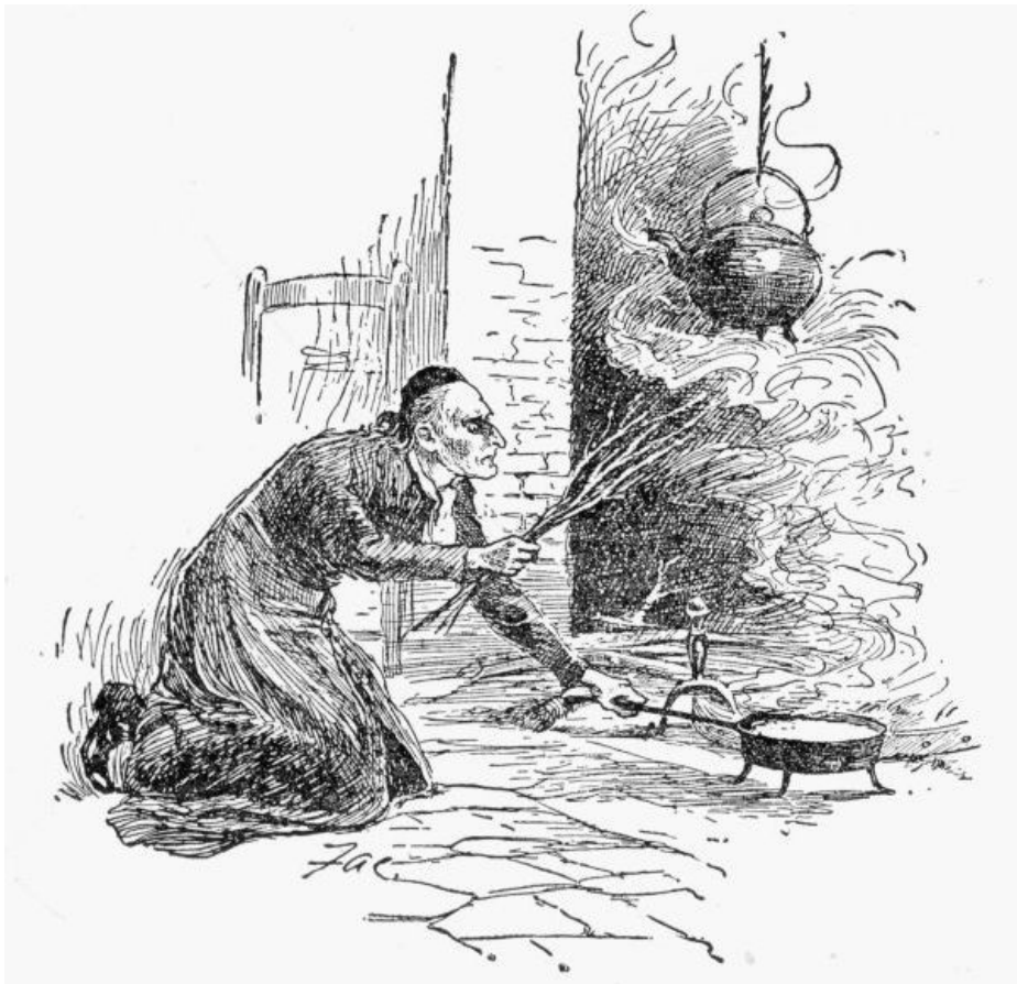
AT EVERY STROKE HE REPEATED, "I DO THIS IN THE NAME OF THE LORD."

"I do this in the name of the Lord," which he repeated with every stroke.