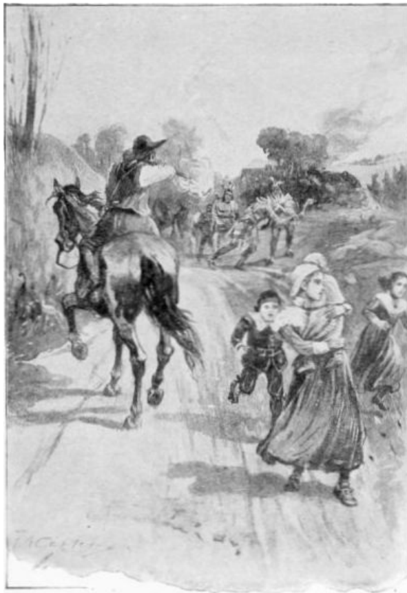
THE RESOLUTE FATHER CONTINUED TO FIRE AS HE RETREATED.

After this, the Indians, according to their custom, divided their prisoners. Mrs. Dustin, Mrs. Neff and a captive lad from Worcester fell to the share of an Indian family consisting of twelve persons. These now took charge of the captives and treated them with no particular unkindness, save that of forcing them to extend their journey still further toward an Indian settlement. One day they told the prisoners that there was one ceremony to which they must submit after their arrival at their destination, and that was running the gauntlet between two files of Indians. This announcement filled Mrs. Dustin and her companions with so much dread, that they mutually resolved to make a desperate attempt to escape.