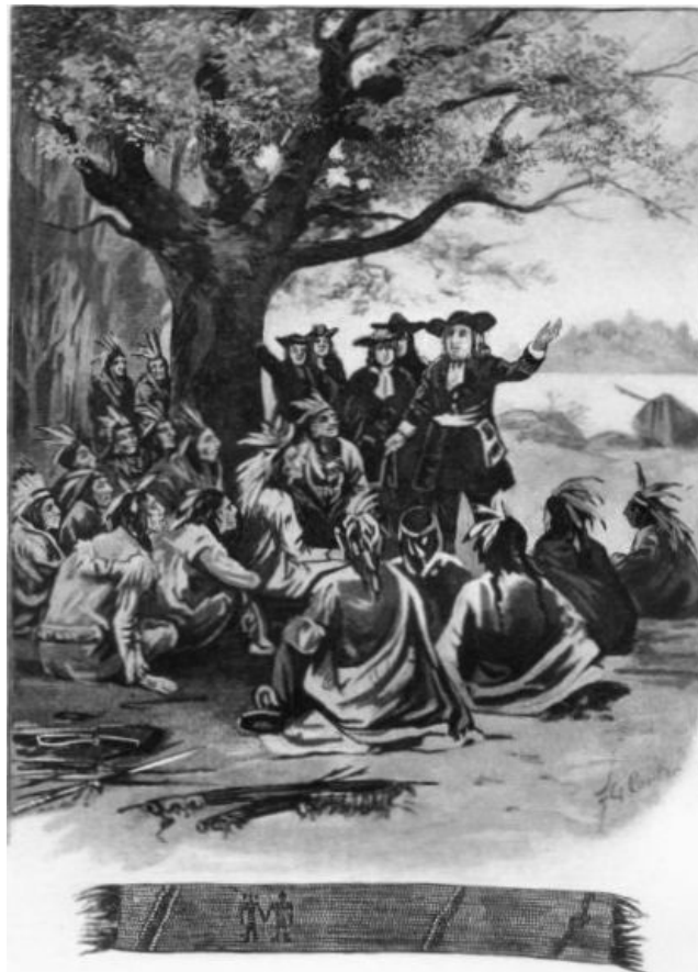
WILLIAM PENN MAKING HIS TREATY OF PEACE AND FRIENDSHIP WITH THE INDIANS