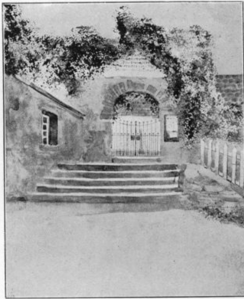
GATEWAY, FOULIS CHURCH.