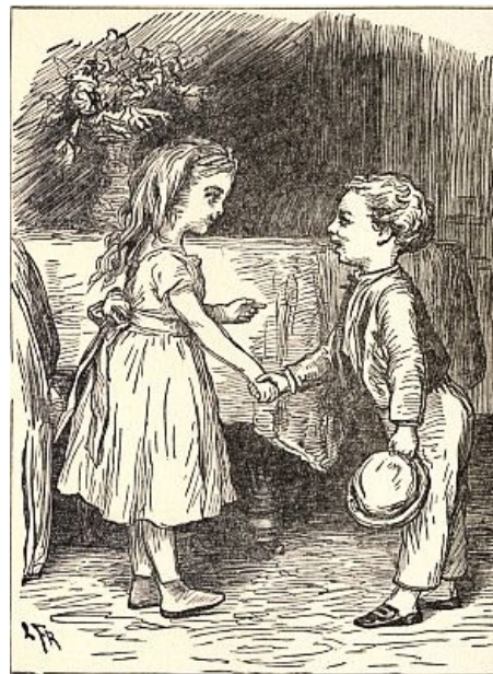
"Good morning. Where do you come from?"

"I can't understand it!" said Lucy; "did you come like other people, by the train, not like the children in my dreams?"