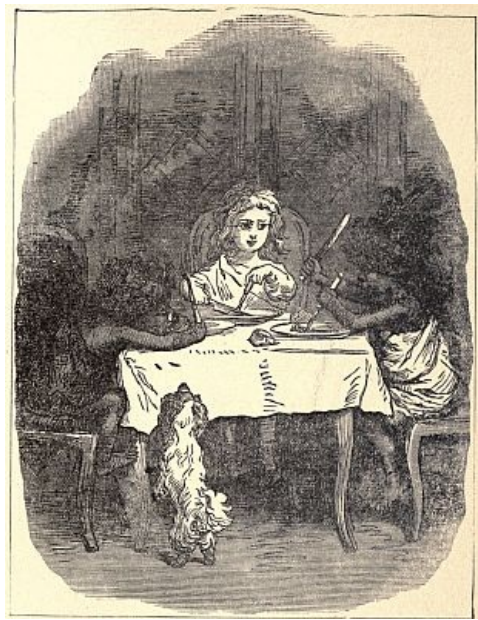
"I can eat much better without," said Lavo. Page 30.

And Lucy found rising before her, instead of her own nursery, a huge tree, on the top of a mound. [1] Basket-work had been