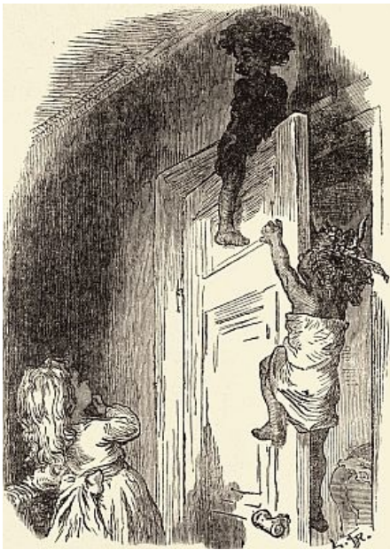
Lavo had climbed up the side of the door, and was sitting astride on the top of it.