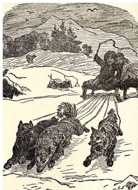
Whisking over the snow with all her might and main, muffled up in cloaks and furs.

Here were his father's dogs overtaking her; picking her—some one picking her up. No, it was Don! and here was Mrs. Bunker exclaiming, "Well, I never thought to find Miss Lucy in no better a place than on Master's old bearskin!"