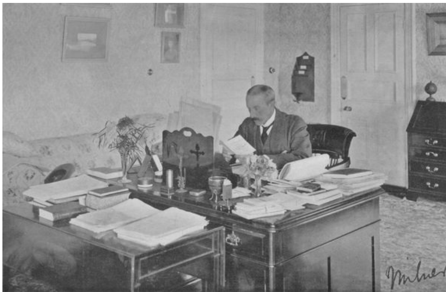
LORD MILNER AT SUNNYSIDE.