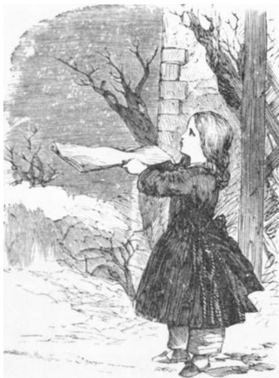
Winnie catching the Snow-flakes. Vol. VI., p. 103

In the Clerk's Office of the District Court of Massachusetts.