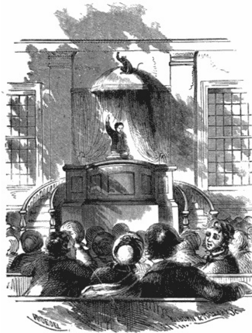
MONKEY IN CHURCH. Page 88 .

Obvious typographical errors have been corrected. A list of corrections is found at the end of the text.