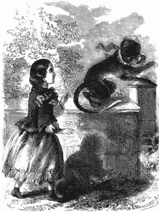
JACKO RUNNING AWAY. Page 52.

His tail, which had now fully healed, was of great use to him on this occasion, when, to Minnie's great surprise, he clung with it to the bar of the rack, and began to swing himself about.